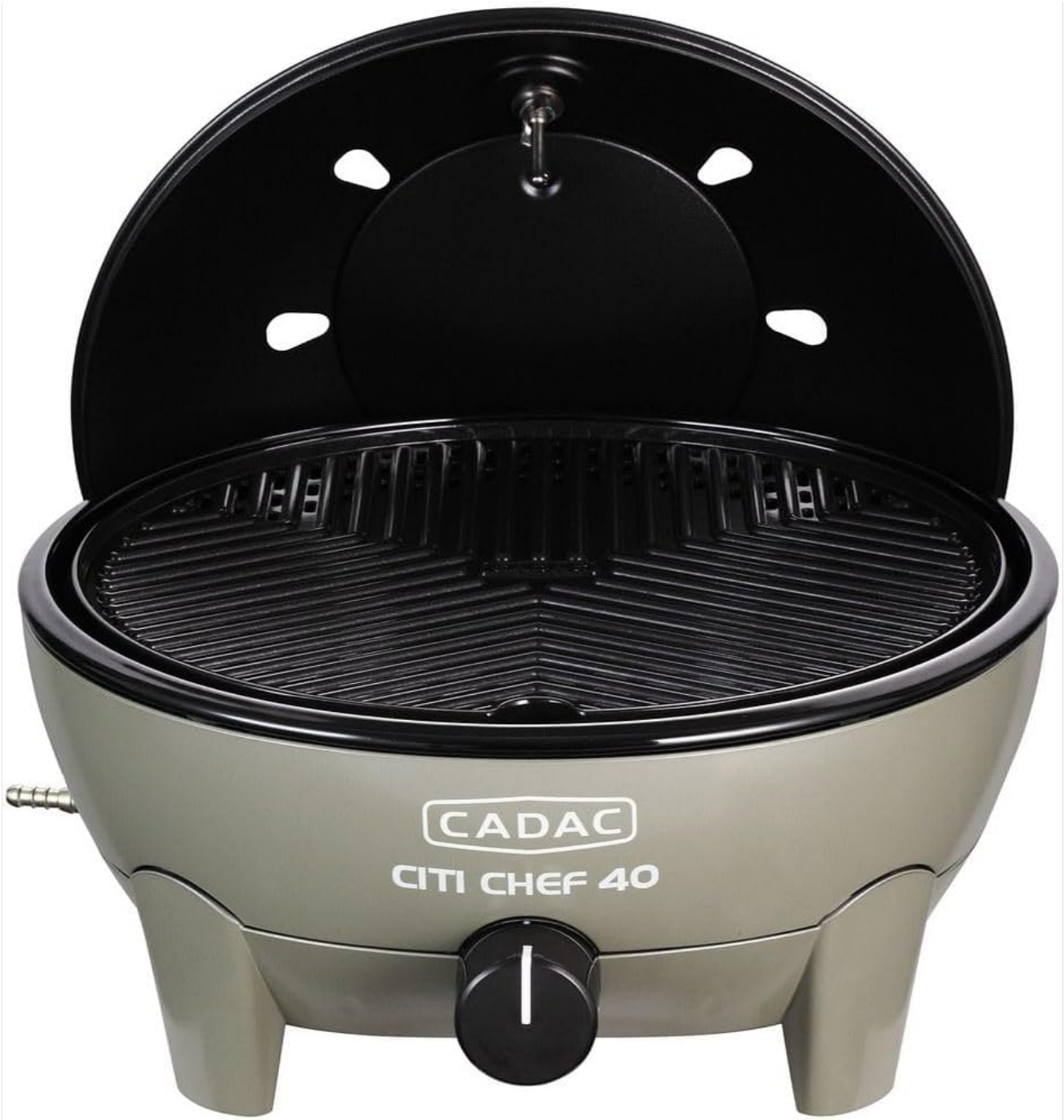
Figure 4.1: The Cadac CITI Chef 40 with its lid open, revealing the GreenGrill ceramic coated grill plate.

This image shows the CITI Chef 40 with its lid raised, exposing the primary cooking surface, the GreenGrill ceramic coated grill plate. This surface is ideal for grilling various foods, and its non-stick properties aid in cooking and cleaning.