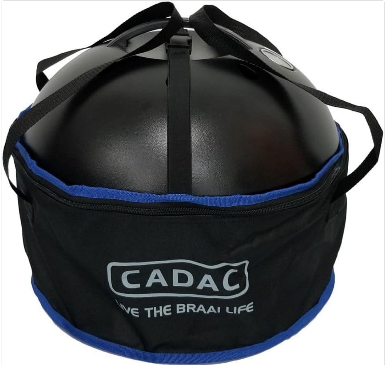
Figure 5.1: The Cadac CITI Chef 40 neatly packed into its dedicated carry bag for convenient storage and transport.

This image demonstrates the portability and ease of storage for the CITI Chef 40, showing the unit securely placed within its custom-fitted carry bag. This feature protects the barbecue and makes it easy to move.