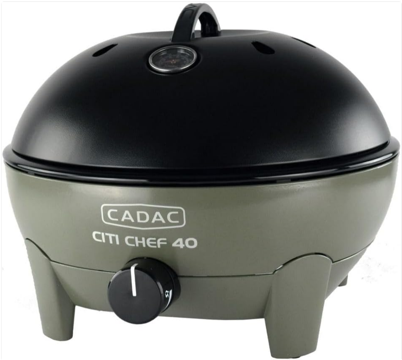
Figure 3.1: The Cadac CITI Chef 40 Gas Barbecue in its assembled state with the lid closed, ready for gas connection.

This image displays the complete Cadac CITI Chef 40 unit with its lid closed, showcasing its compact design. The gas inlet is visible on the side, where the gas hose and regulator will be connected to the gas supply.