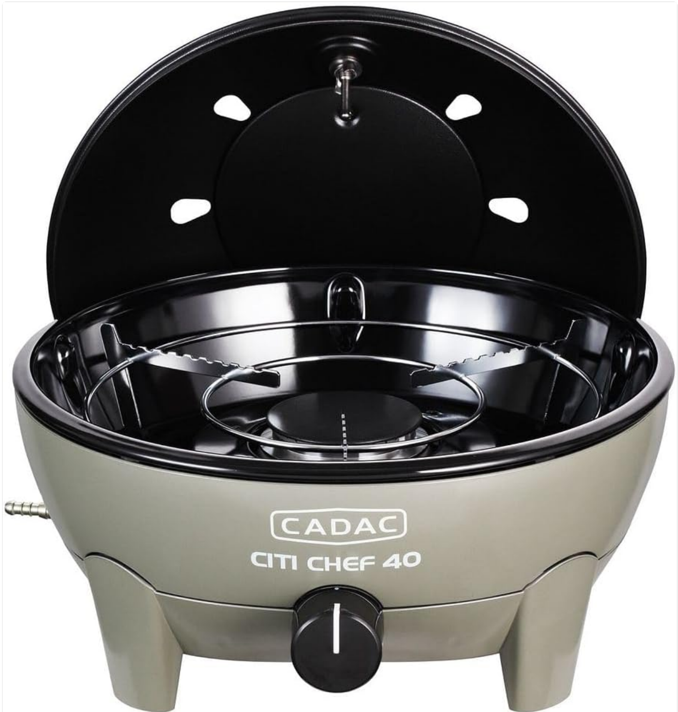
Figure 4.2: The Cadac CITI Chef 40 with its lid open, showing the pot stand in place over the burner.

This image illustrates the CITI Chef 40 configured with the pot stand. This accessory allows users to place pots, pans, or kettles directly over the burner, expanding the cooking versatility beyond just grilling.