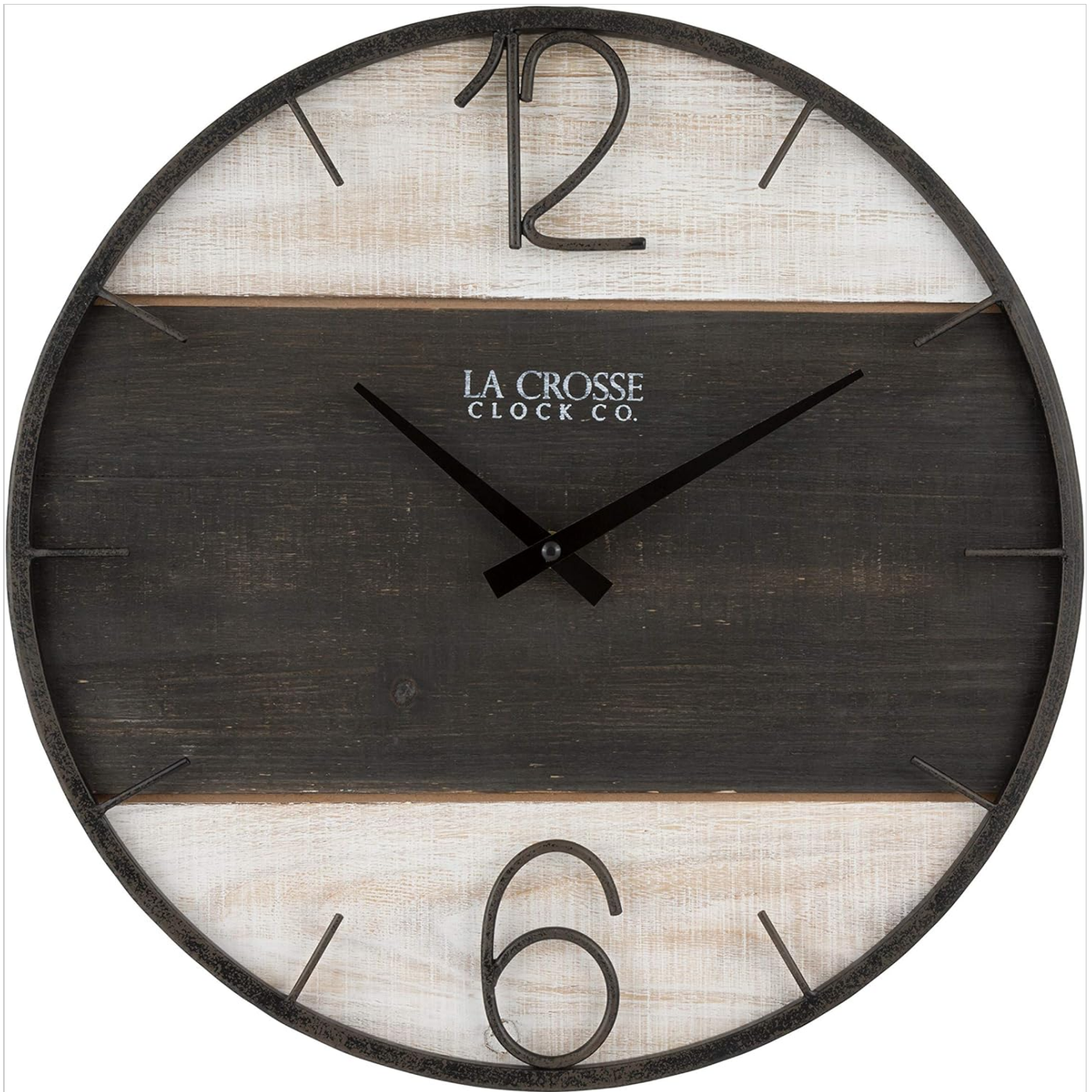
Image 1.1: Front view of the La Crosse Technology 404-4040 16-Inch Ironwood Wall Clock, showcasing its dual-toned wooden dial and metal frame.