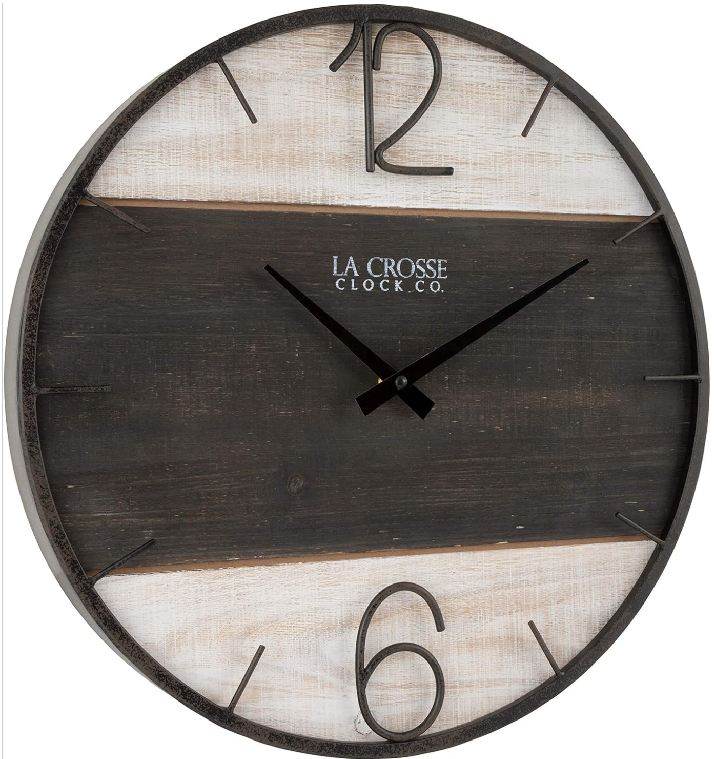
Image 3.1: Side view of the clock, illustrating the frame and depth for mounting reference.