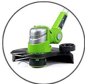
Image: Visual representation of Greenworks string trimmer models compatible with these replacement parts.