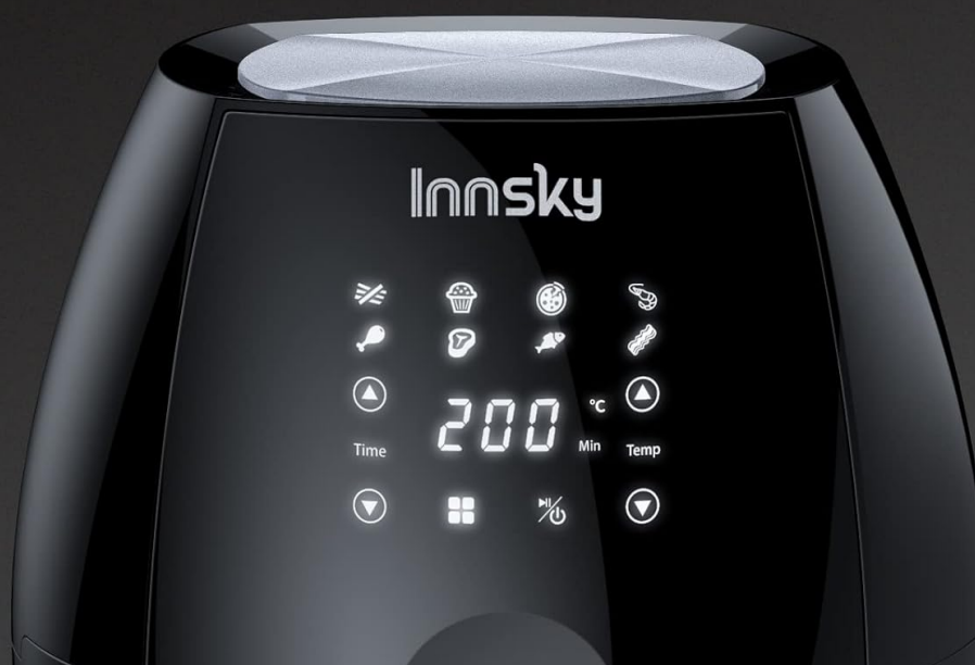
Image: Close-up of the Innsky Air Fryer's digital control panel, highlighting the 8 preset cooking icons for various food types.