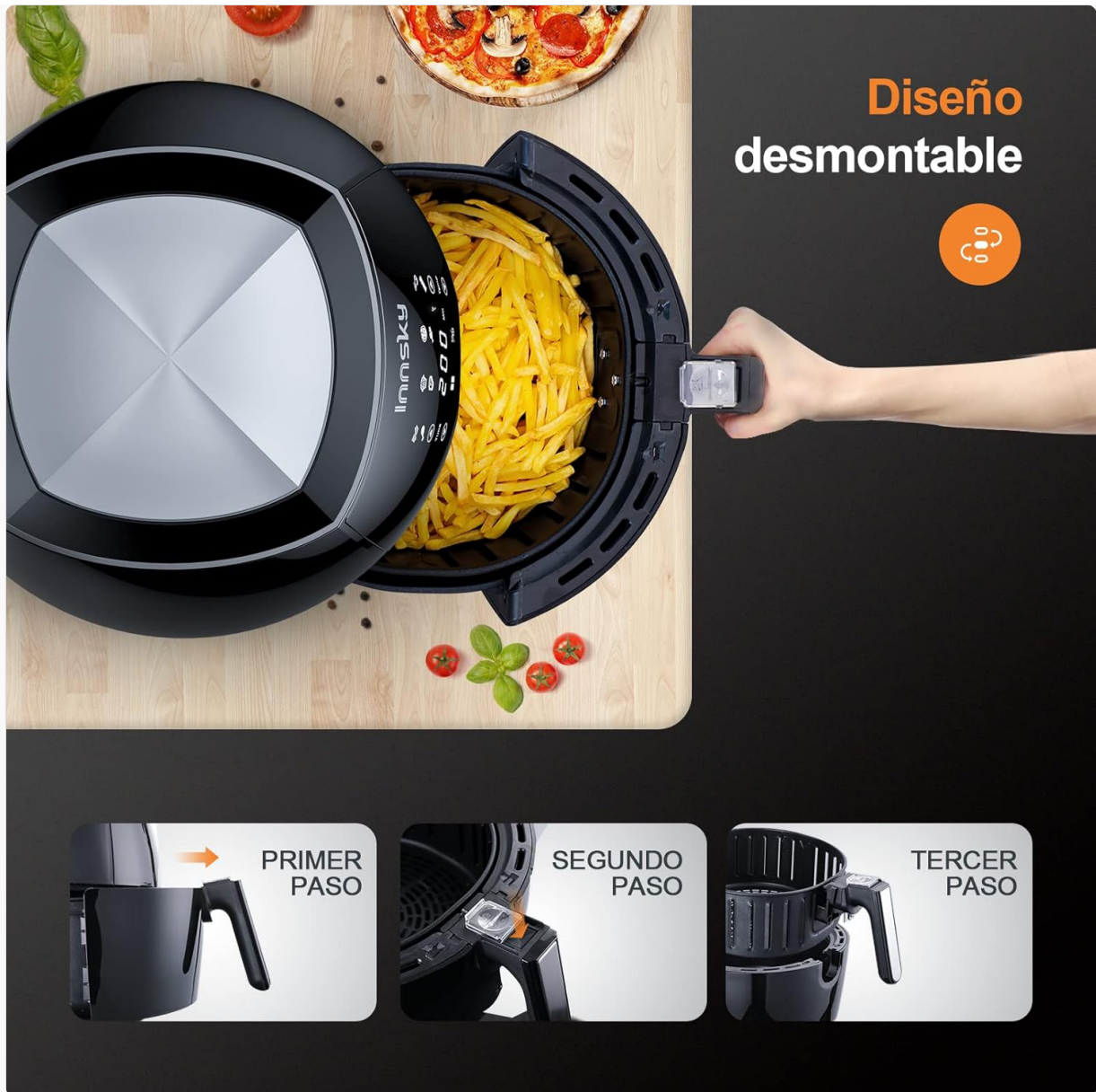
Image: A visual guide demonstrating the three simple steps to detach the frying basket from its holder for serving or cleaning.