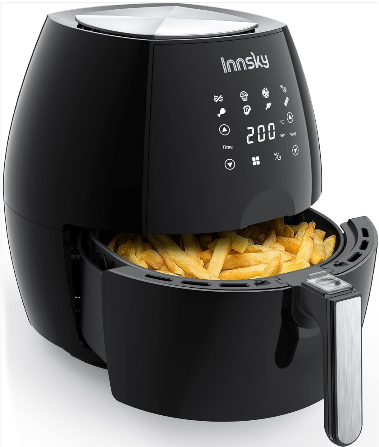
Image: The Innsky 5.5L Air Fryer, showcasing its sleek black design and the cooking basket filled with golden-brown fries.