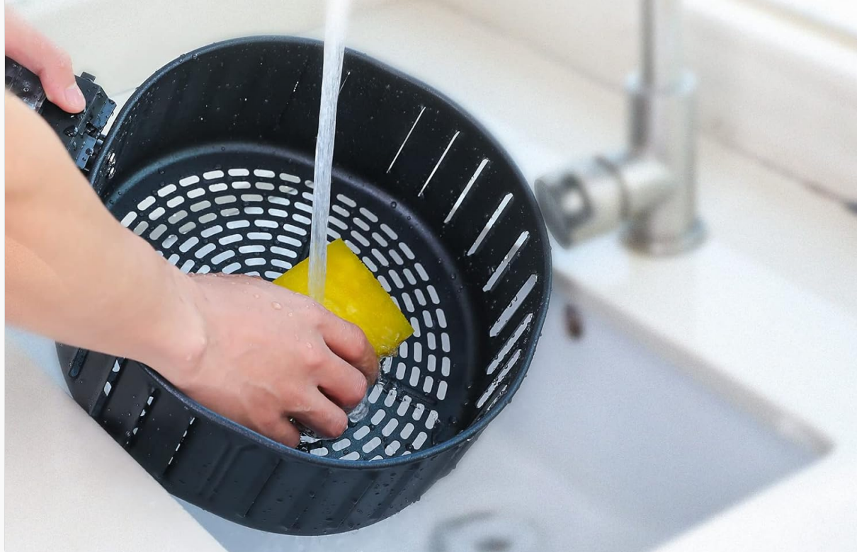
Image: A hand cleaning the non-stick frying basket of the Innsky Air Fryer under running water, demonstrating its easy-to-clean design.