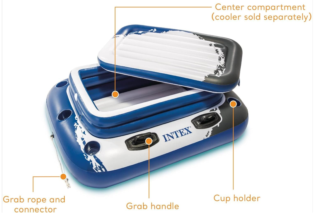
Image: Features of the Intex Mega Chill II Inflatable Beverage Cooler.