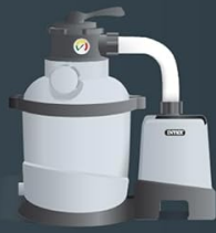
Krystal Clear™ Sand Filter Pump SX2800