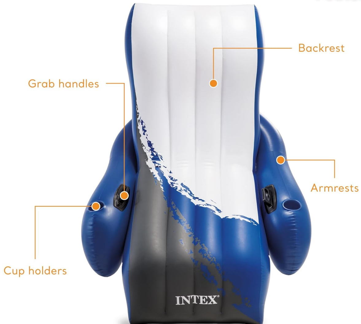
Image: Features of the Intex Floating Recliner Lounge.