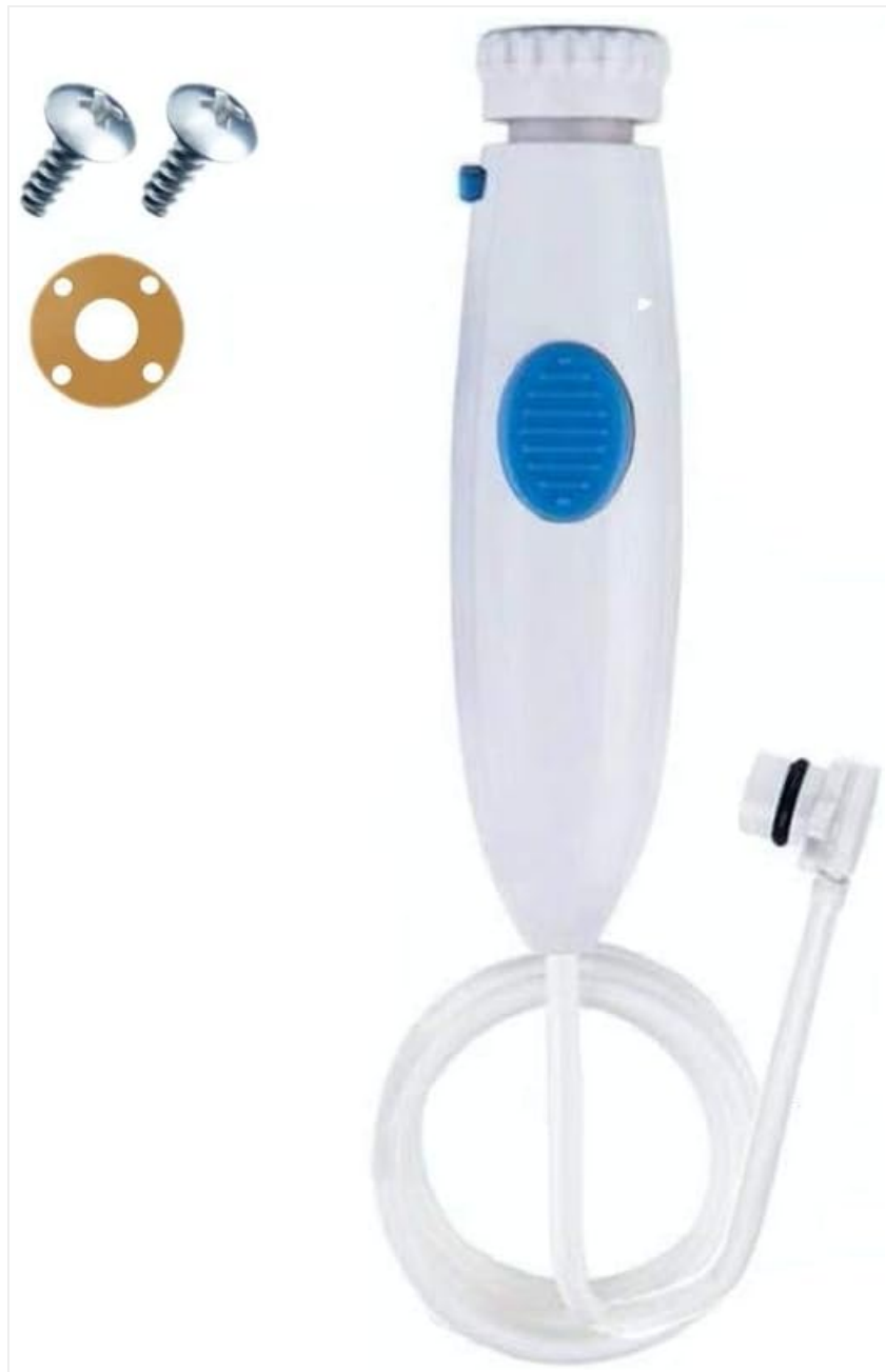
Figure 1: AquaFlosser Standard Water Hose Plastic Handle Assembly. This image displays the complete replacement handle, including the hose, handle unit, and the connection point for the irrigator tip.

The AquaFlosser replacement handle assembly is a crucial component for maintaining the performance of your Waterpik oral irrigator. It includes a durable plastic handle with a pause button, a flexible water hose, and a rotating tip connection for optimal oral hygiene.