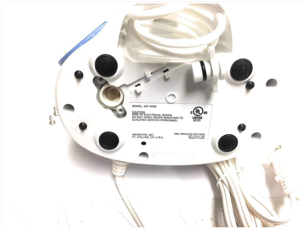
Figure 4: View of the underside of a Waterpik WP-100W unit, illustrating the hose connection point and screw locations. This image serves as a reference for where the replacement handle assembly connects to the main unit.