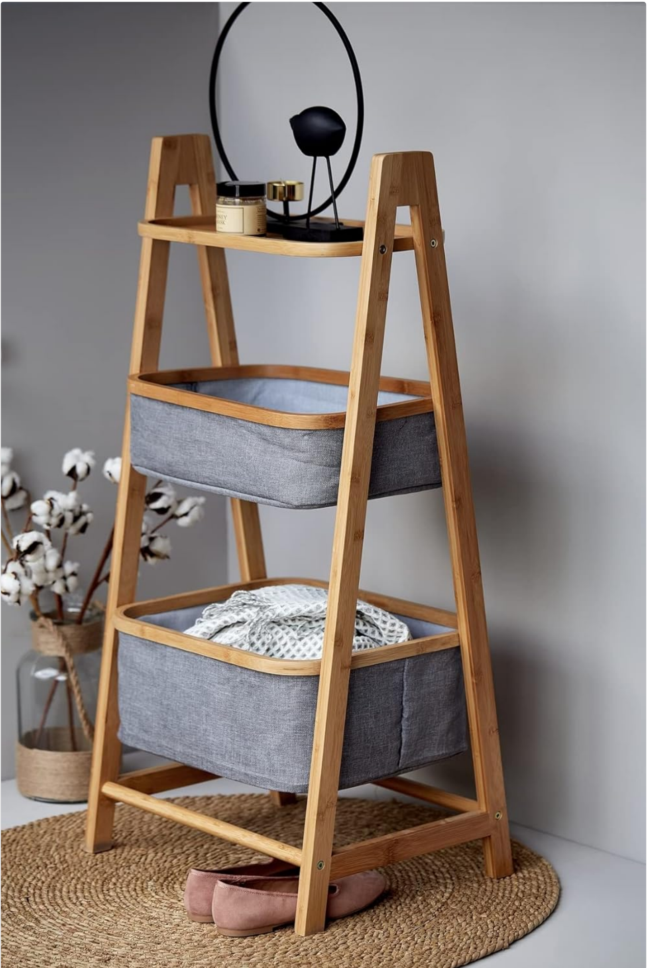
Image 3.1: The shelving unit showcasing its storage capacity with towels and other items.