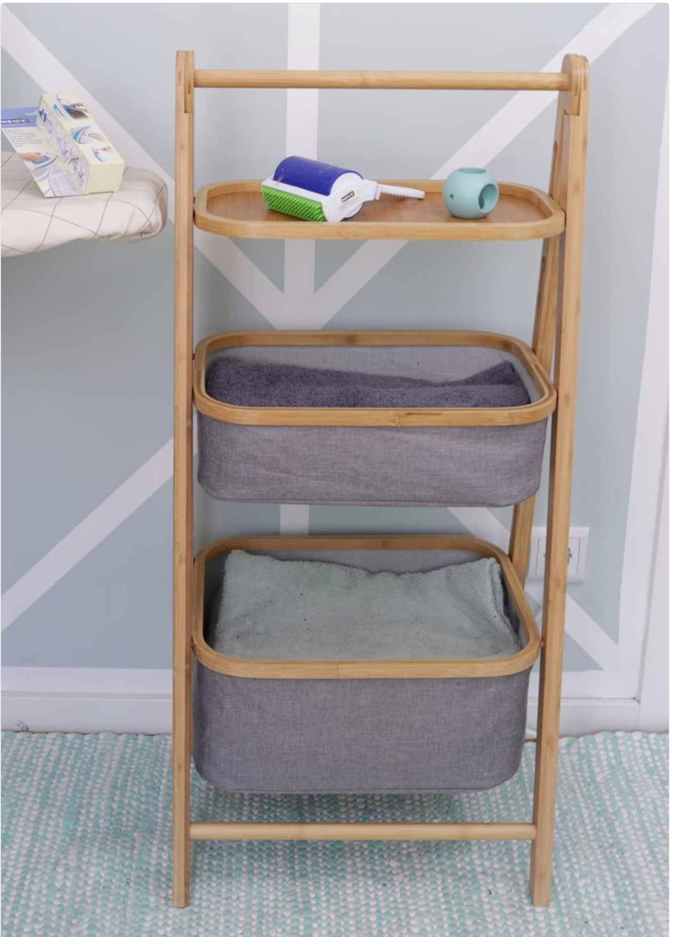
Image 3.2: The shelving unit used for general storage in a living space.