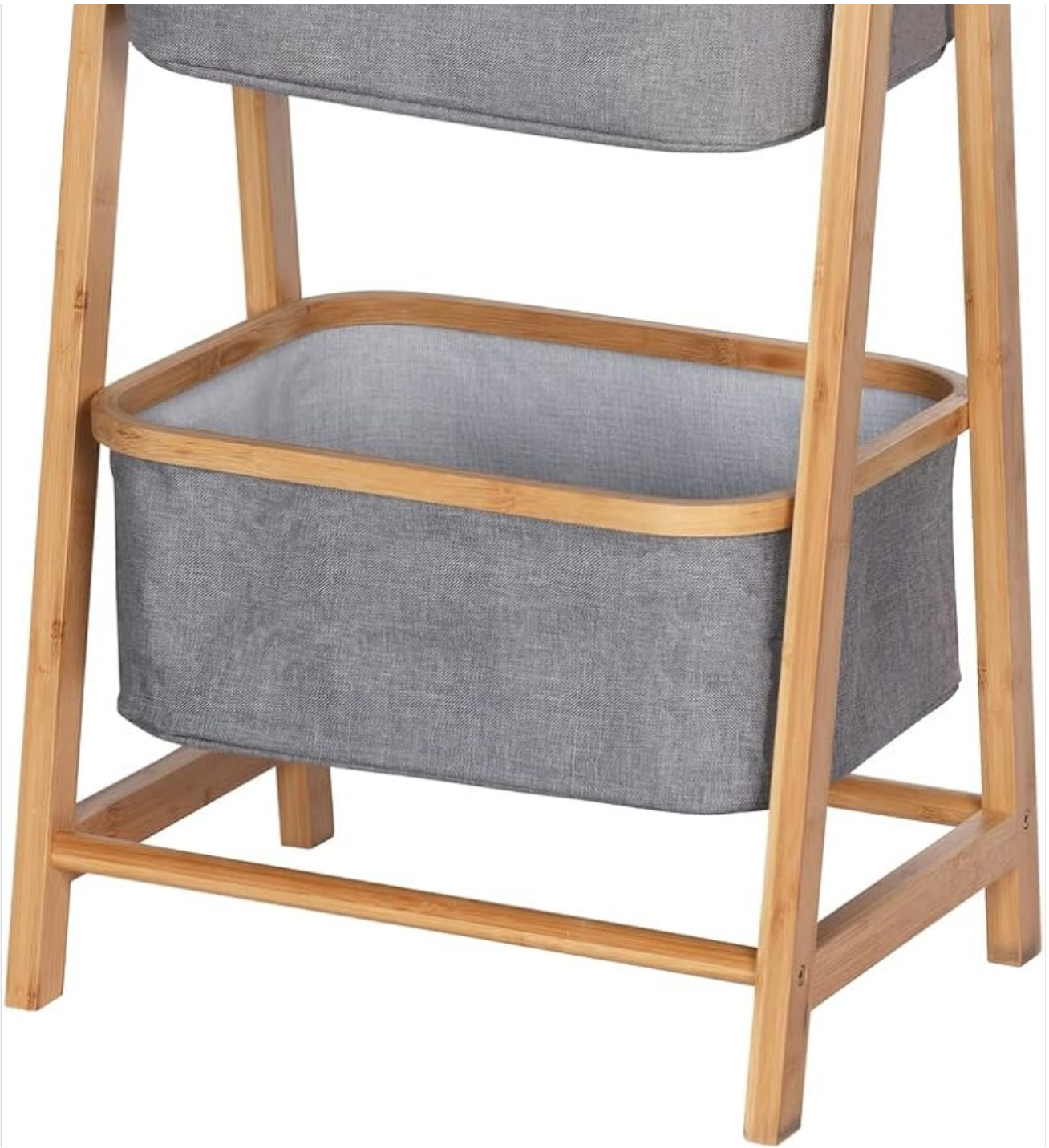
Image 1.1: The WENKO Bahari Shelving Unit, featuring a bamboo frame and two gray polyester storage baskets.