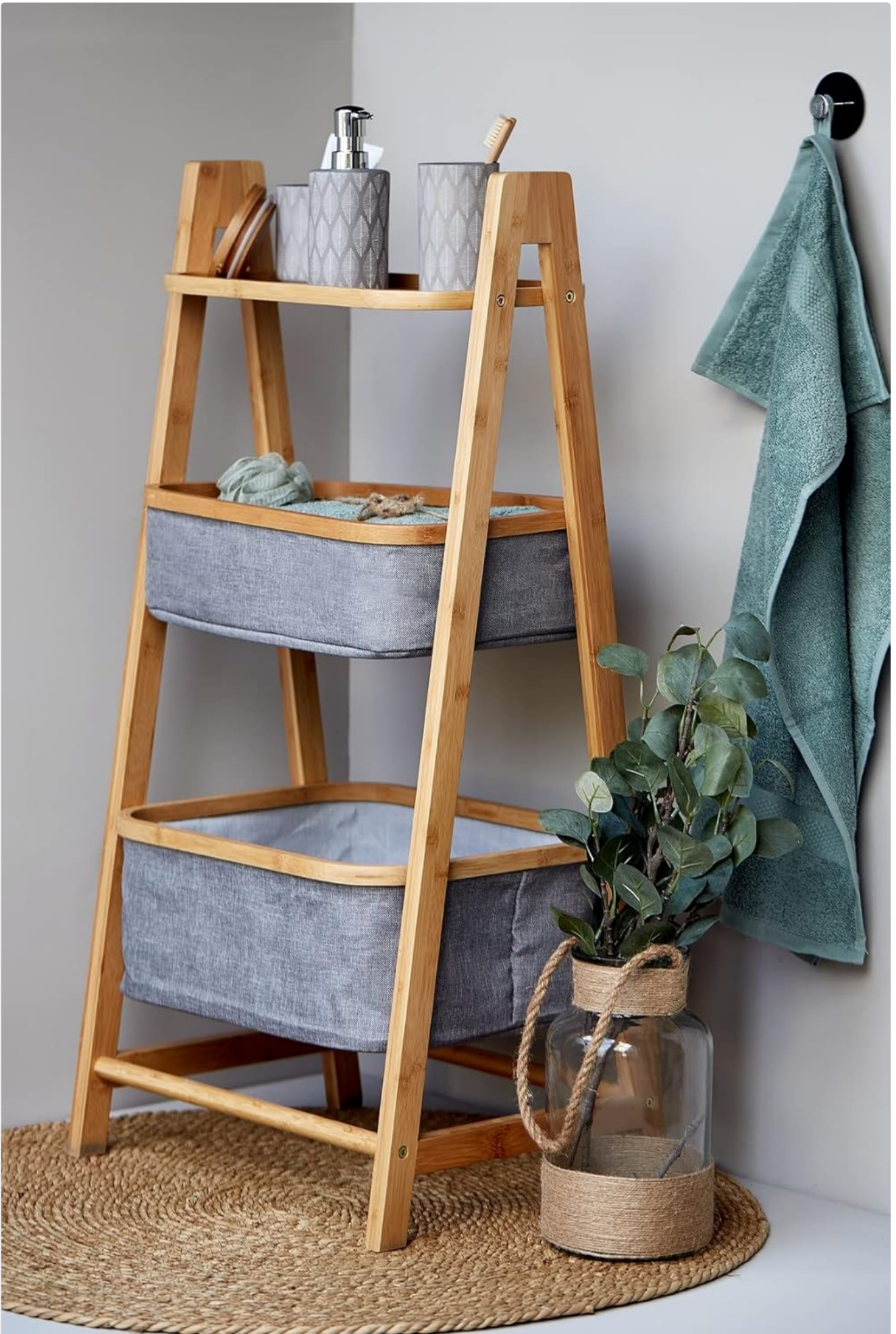
Image 2.1: Example placement of the shelving unit in a bathroom, demonstrating its functional and aesthetic integration.