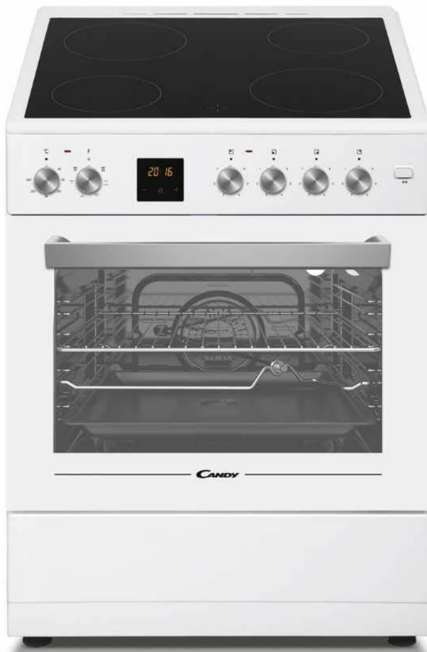
Figure 2.1: Front view of the Candy CVE660MW_E freestanding cooker, showing the ceramic hob, control panel, and oven door.