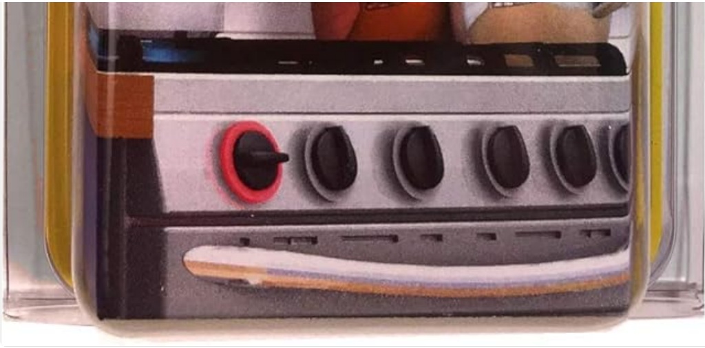
Image 2.1: The front of the BurnerAlert Stove Reminder packaging, indicating a 5-pack of white discs and compatibility with gas or electric stoves.