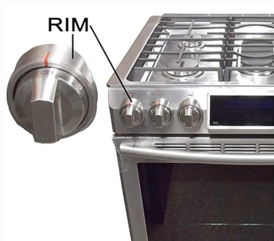
Image 3.1: A visual guide illustrating stove types compatible ('YES' for vertical knob orientation and no rim) and incompatible ('NO' for horizontal knob orientation or knobs with rims) with the BurnerAlert device.