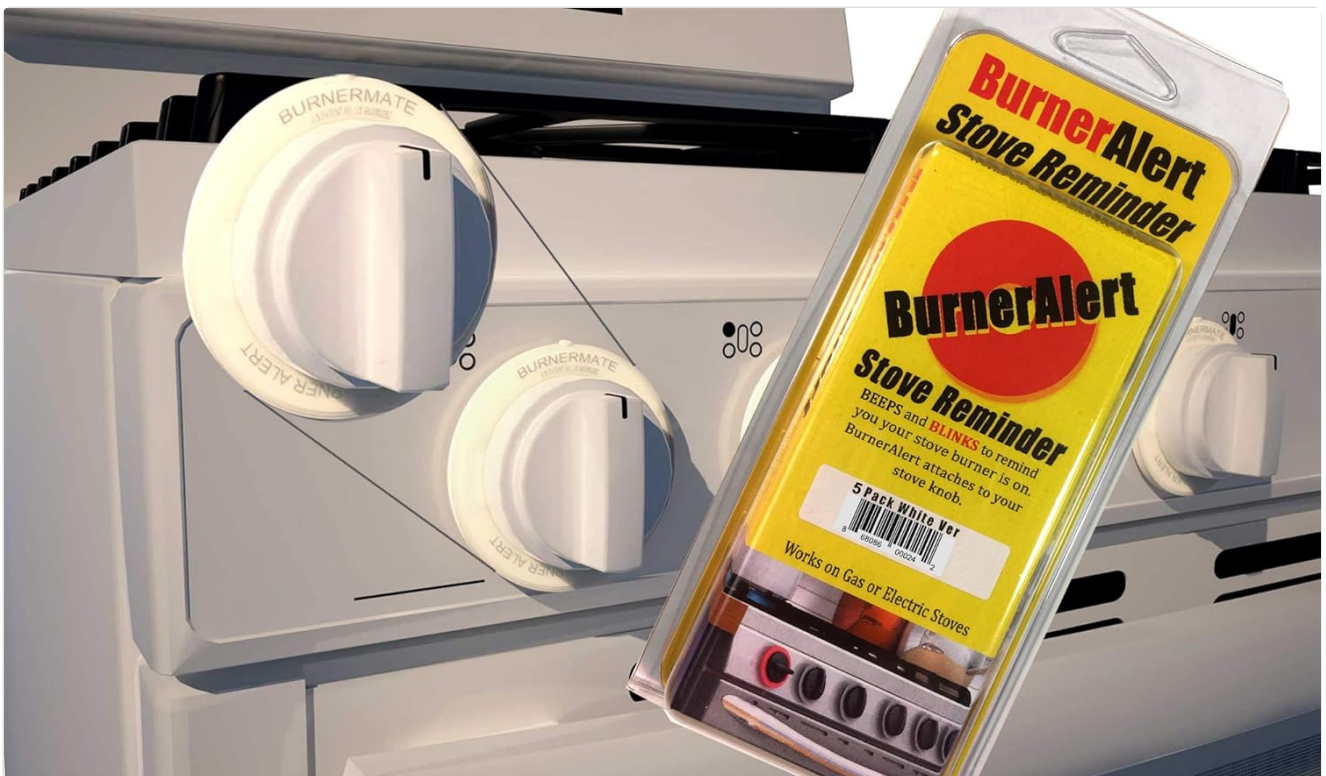
Image 1.1: BurnerAlert Stove Reminder Discs installed on stove knobs, with the product packaging shown on the right. The discs are white and blend with the stove's appearance.

The BurnerAlert Stove Reminder Disc is a safety device designed to provide audio and visual alerts when a stove burner is active. This product helps remind users that a gas or electric stove burner has been turned ON, continuing to alert until the knob is returned to the OFF position. This manual provides instructions for installation, operation, and maintenance of your BurnerAlert discs.