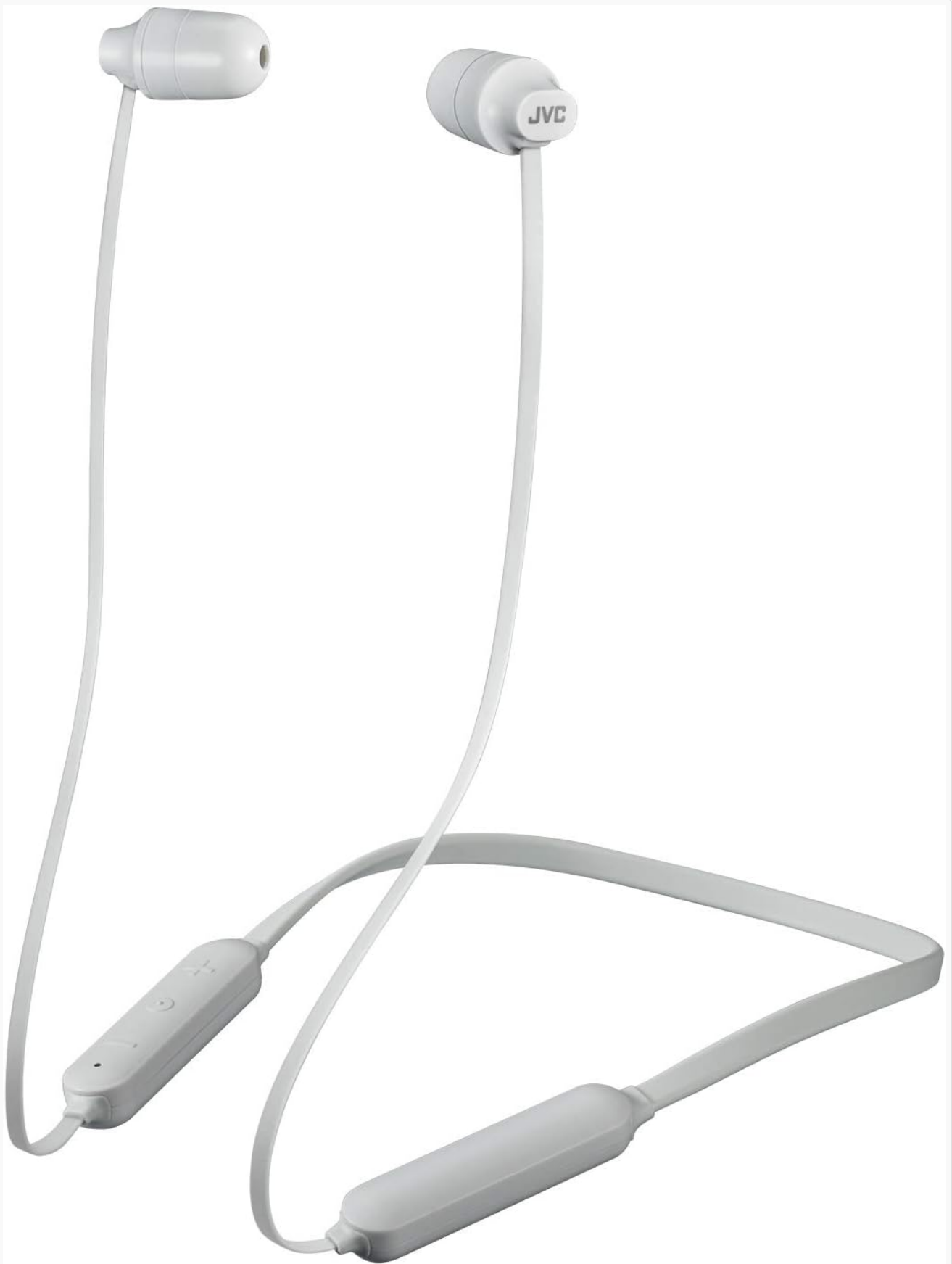
Image: JVC Marshmallow Wireless Earbud Headphones HAFX35BTW in Ivory. This shows the overall design of the headphones, including the earbuds, flexible neckband, and integrated control unit.