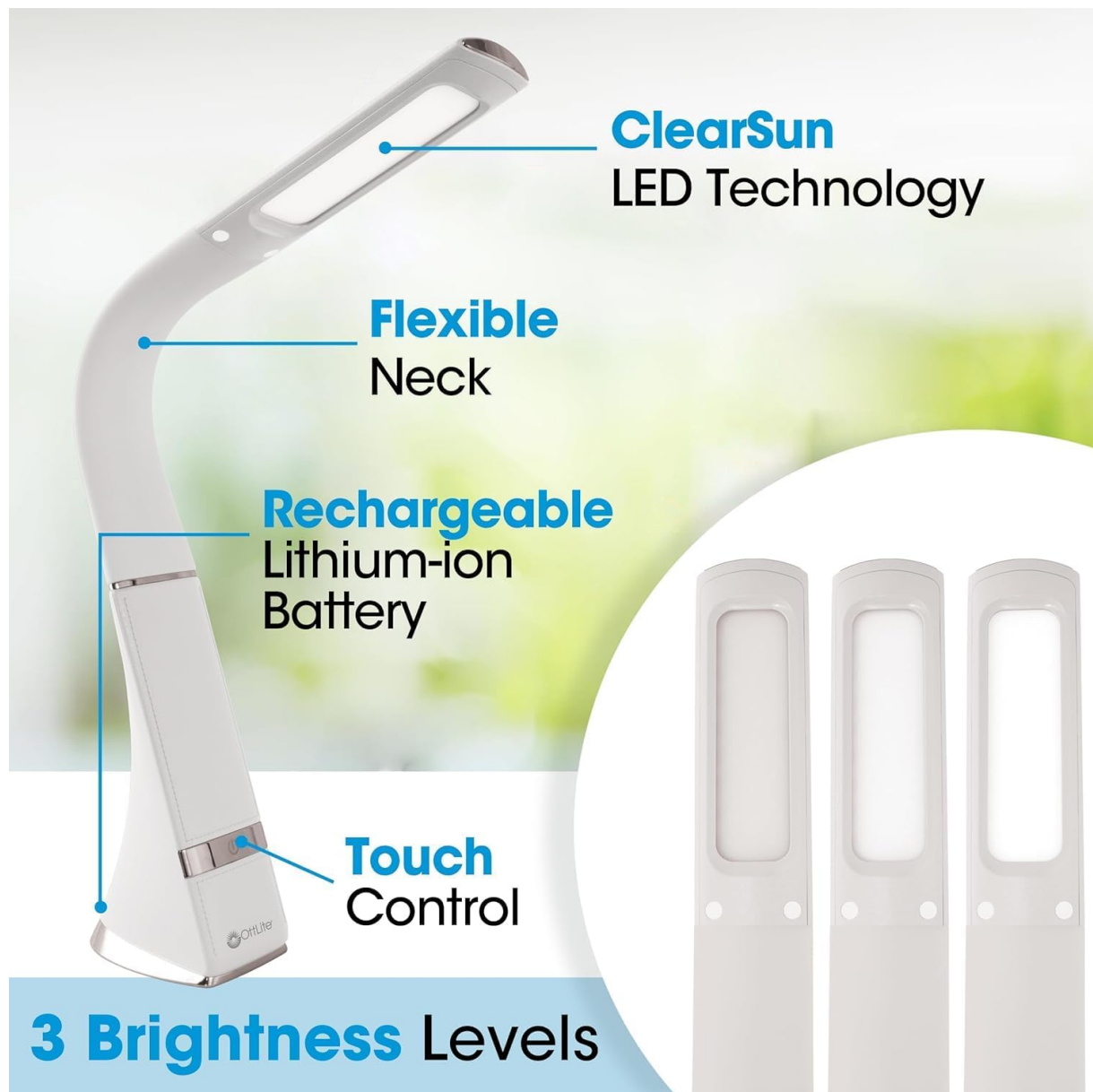
Image 5.1: Lamp features including touch control and brightness levels.