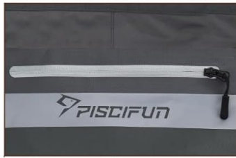
Water-resistant Zippered Pocket