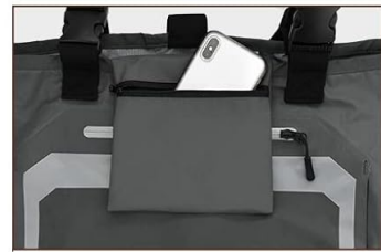
Built-in Phone Pocket