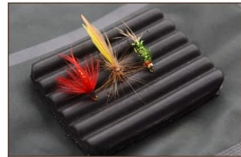
Removable Hook Keeper