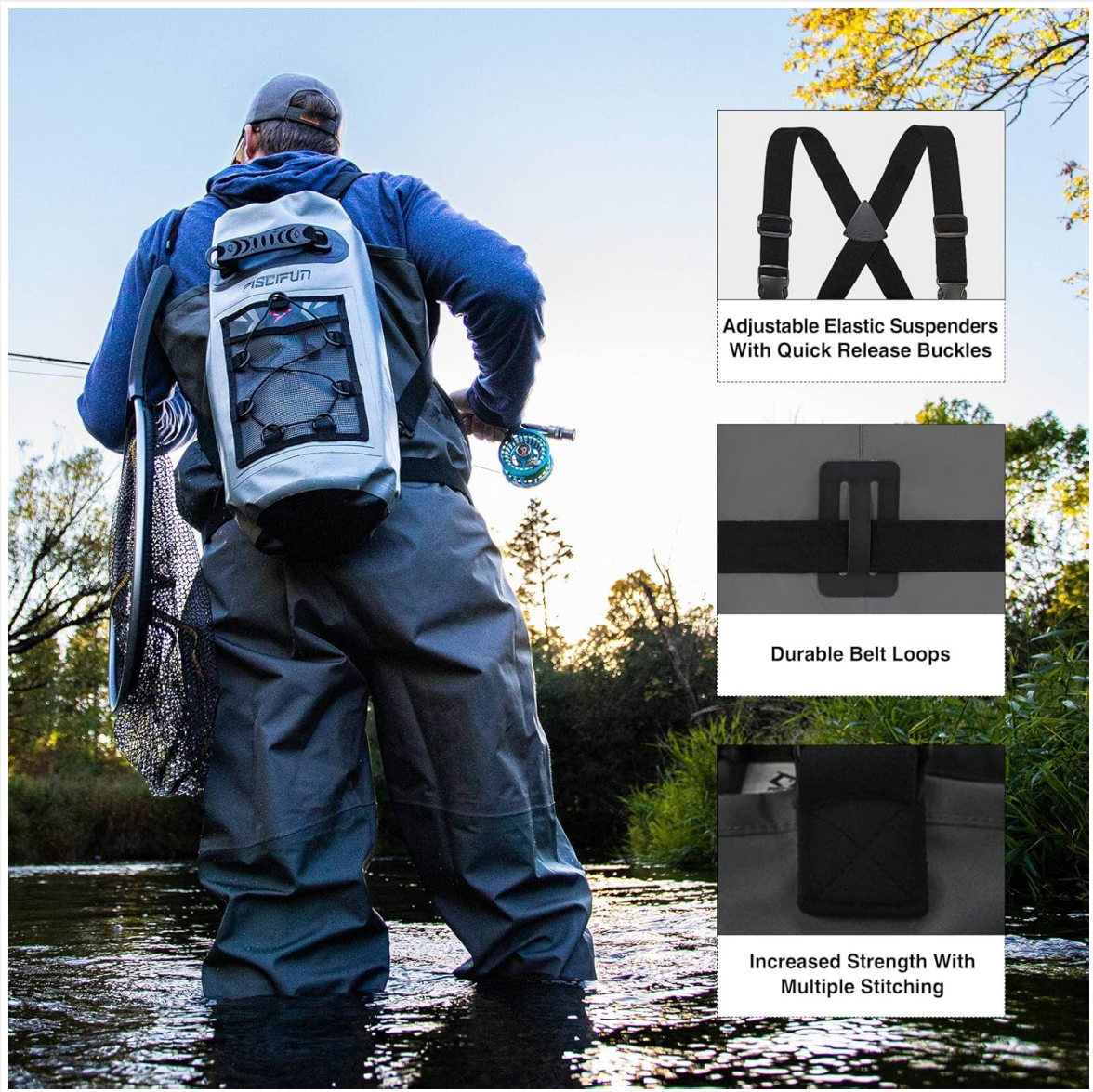
Adjustable Elastic Suspenders With Quick Release Buckles