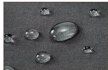
100% Waterproof Material

A composite image showcasing various ergonomic features of the waders, such as secure pockets for essentials, an adjustable belt for a snug fit, a removable fly patch, and comfortable neoprene booties.