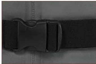
Adjustable Belt & Durable Buckle