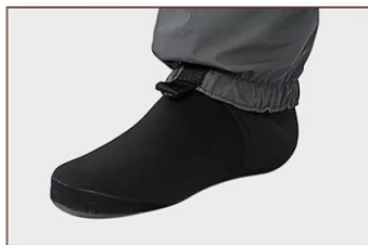
0.15inch/4mm Neoprene Booties