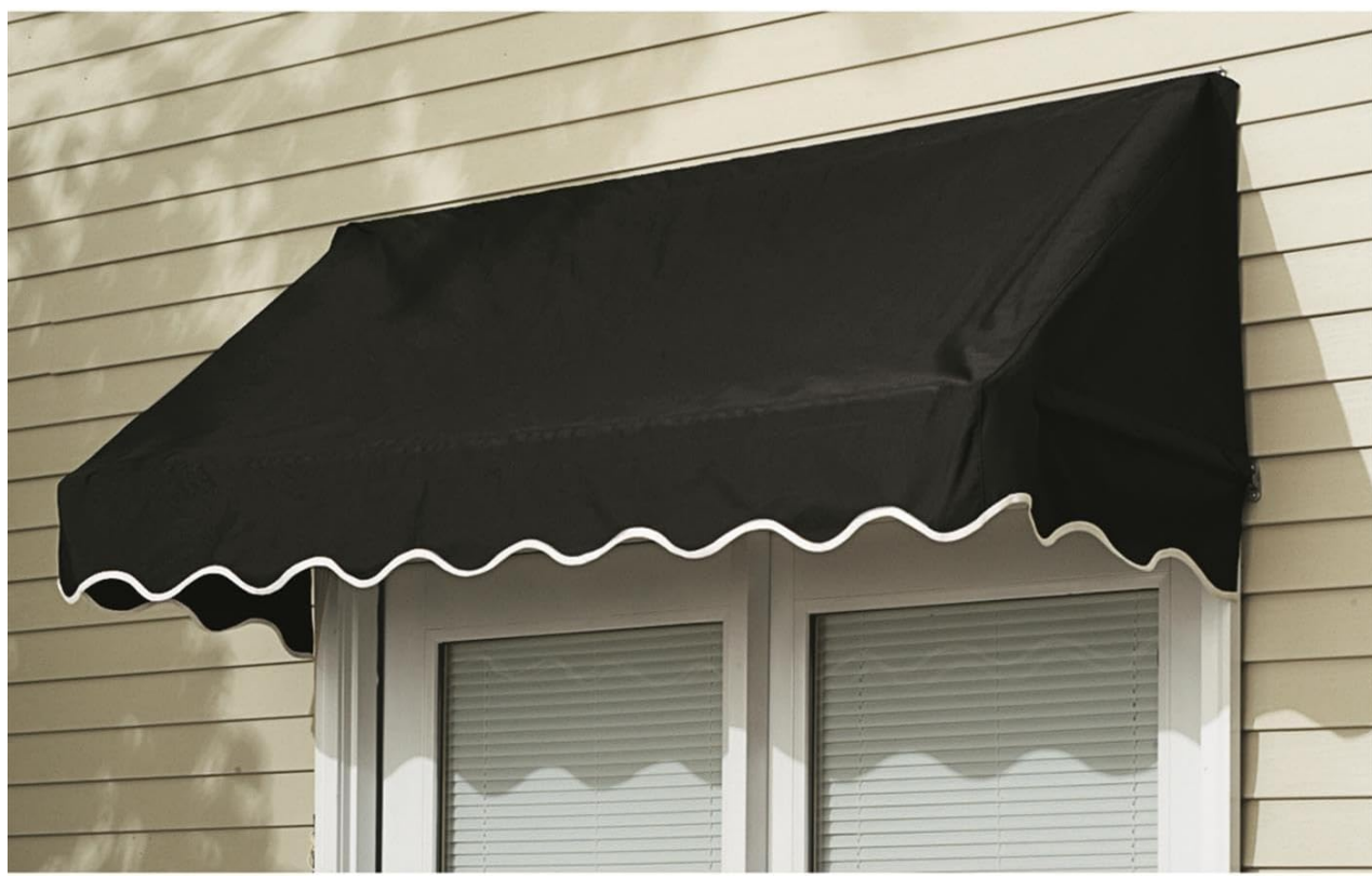
Figure 3.1: Black CASTLECREEK 8' Window Door Awning.