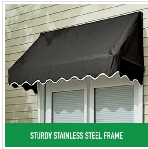
Figure 4.1: Sturdy Stainless Steel Frame.