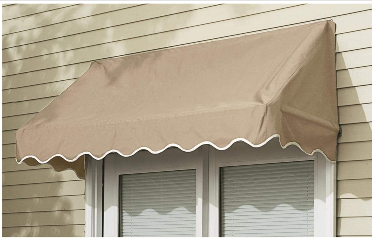
Figure 3.2: Linen colored CASTLECREEK 8' Window Door Awning.