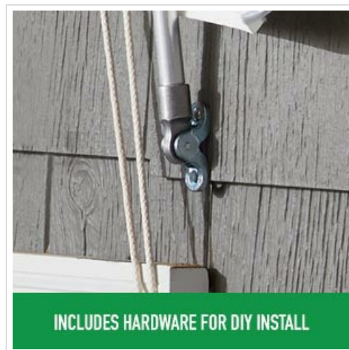
Figure 4.2: Included Hardware for DIY Installation.