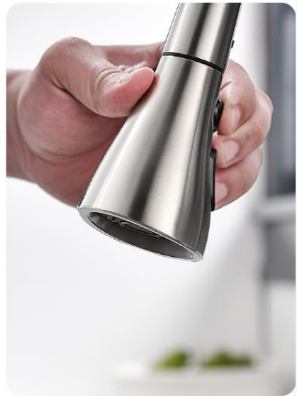
Image: A woman using the APPASO kitchen faucet to fill a glass of water, highlighting its ergonomic design.