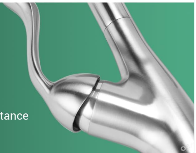
Image: Infographic detailing water-saving features, hot and cold water control, and surface upgrade technology for enhanced durability.