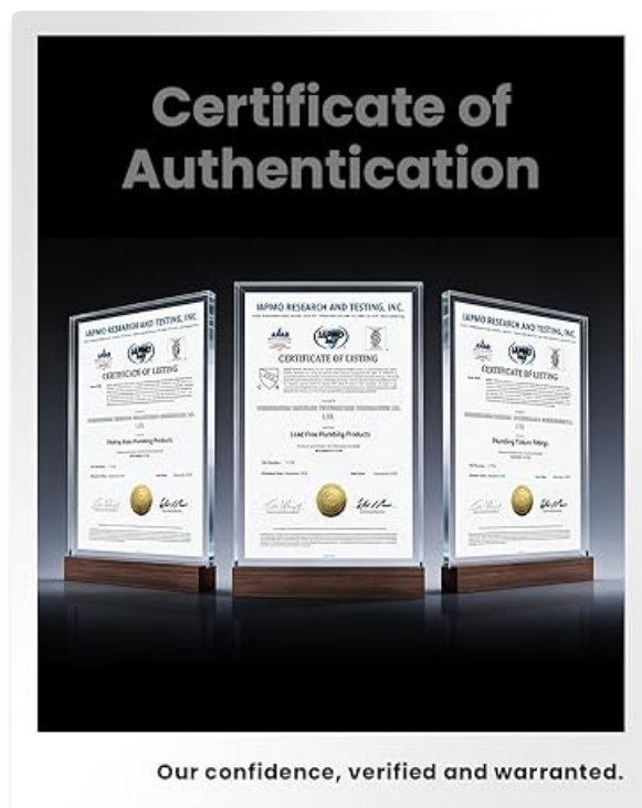
Image: Certificate of Authenticity for APPASO products, ensuring quality and compliance.