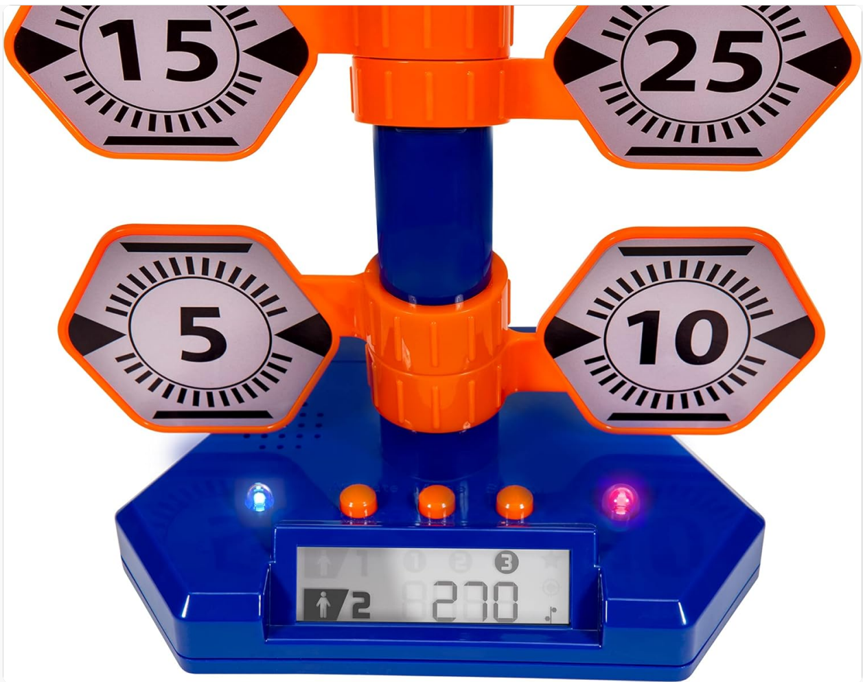
Figure 4: Detailed view of the LCD screen and control buttons.