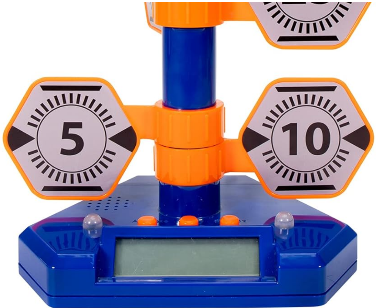
Figure 1: Front view of the NERF Bulls-Eye Digital Target.