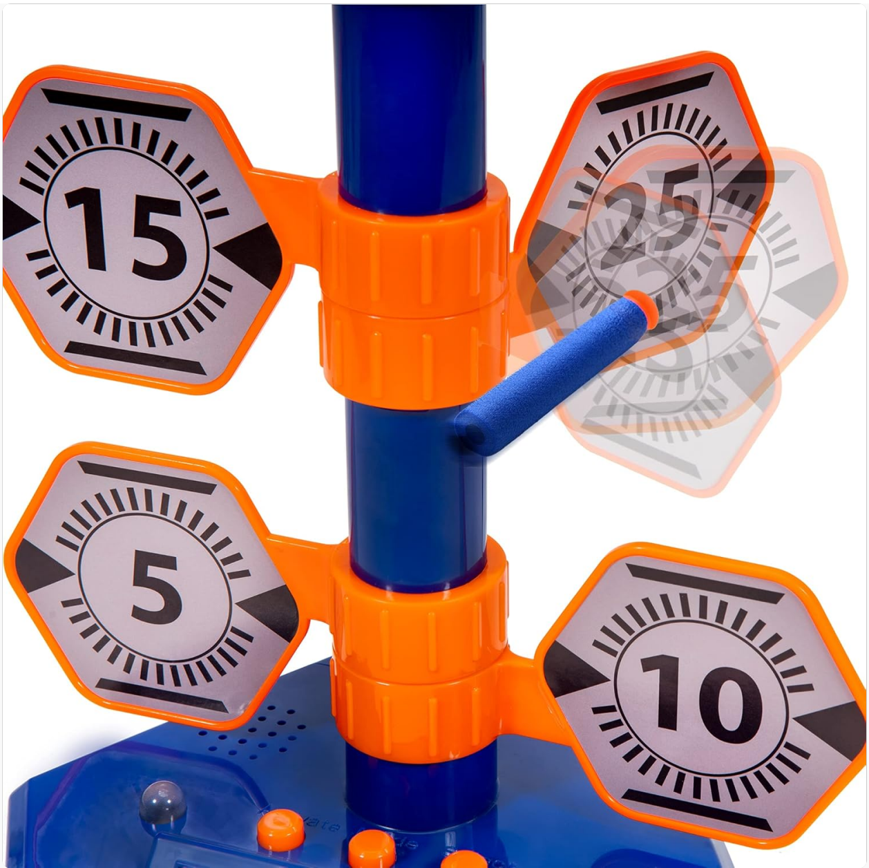
Figure 5: The swinging action of the targets upon impact.