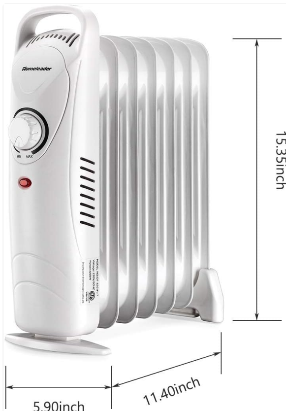
Diagram showing the compact dimensions of the heater: 15.35 inches (height), 11.40 inches (width), and 5.90 inches (depth).