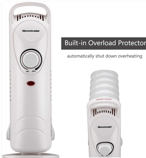
Illustration of the heater's built-in overload protector, which automatically shuts down the unit if it overheats, and a 'DO NOT COVER' warning.