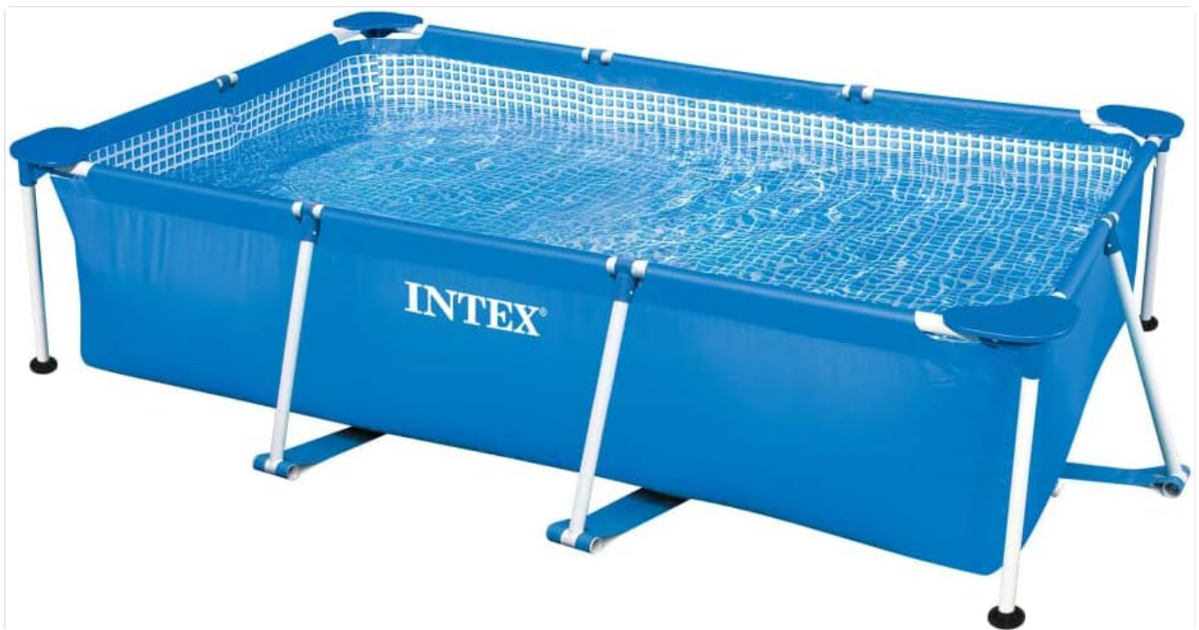
Image 1.1: The Intex Rectangular Frame Swimming Pool, model 28271NP, shown filled with water. This image displays the blue liner and the white metal frame structure supporting the pool.

This manual provides essential information for the safe and efficient use of your Intex Rectangular Frame Swimming Pool. Please read all instructions carefully before setup and operation.