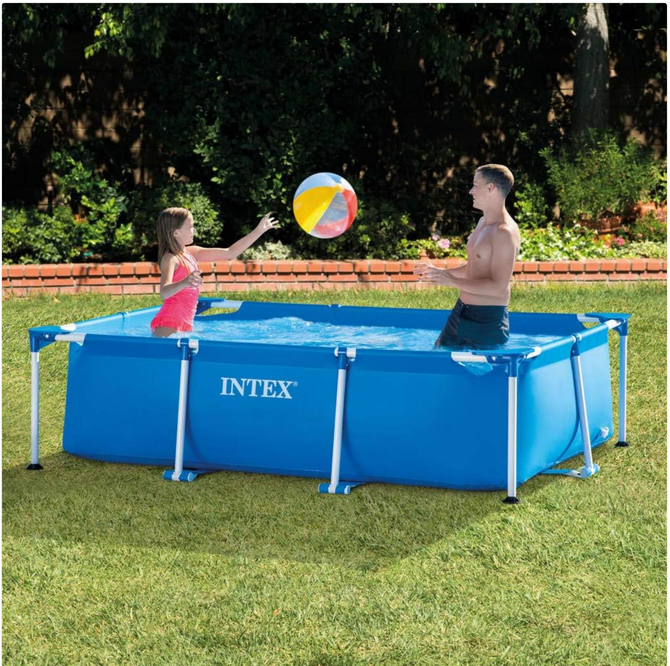
Image 5.1: Two individuals, an adult and a child, enjoying the Intex Rectangular Frame Swimming Pool in a backyard setting. This illustrates the typical use of the pool for recreation.