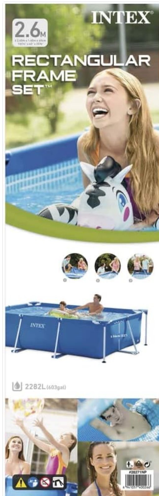
Image 3.1: The retail packaging for the Intex Rectangular Frame Set, showing key features and dimensions. This image provides an overview of the product as it appears in its box.