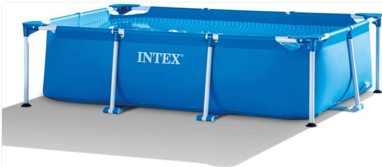
Image 4.1: The Intex Rectangular Frame Swimming Pool shown empty, highlighting its sturdy metal frame structure before or during the filling process. This view emphasizes the robust design.