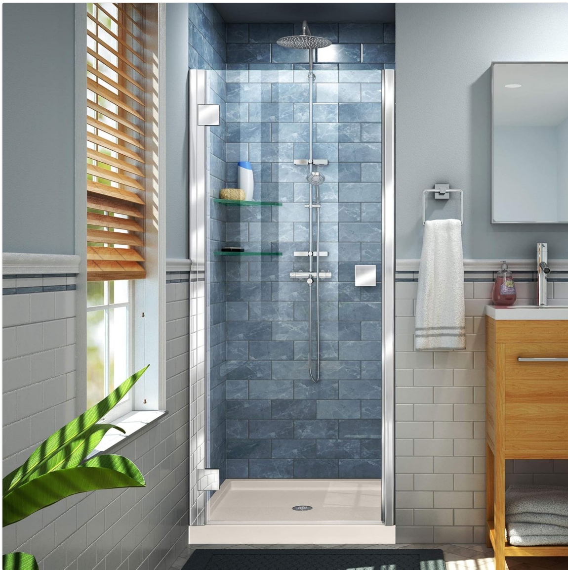
Figure 1: DreamLine Lumen Shower Door and SlimLine Base Kit in a bathroom setting.

Your browser does not support the video tag.