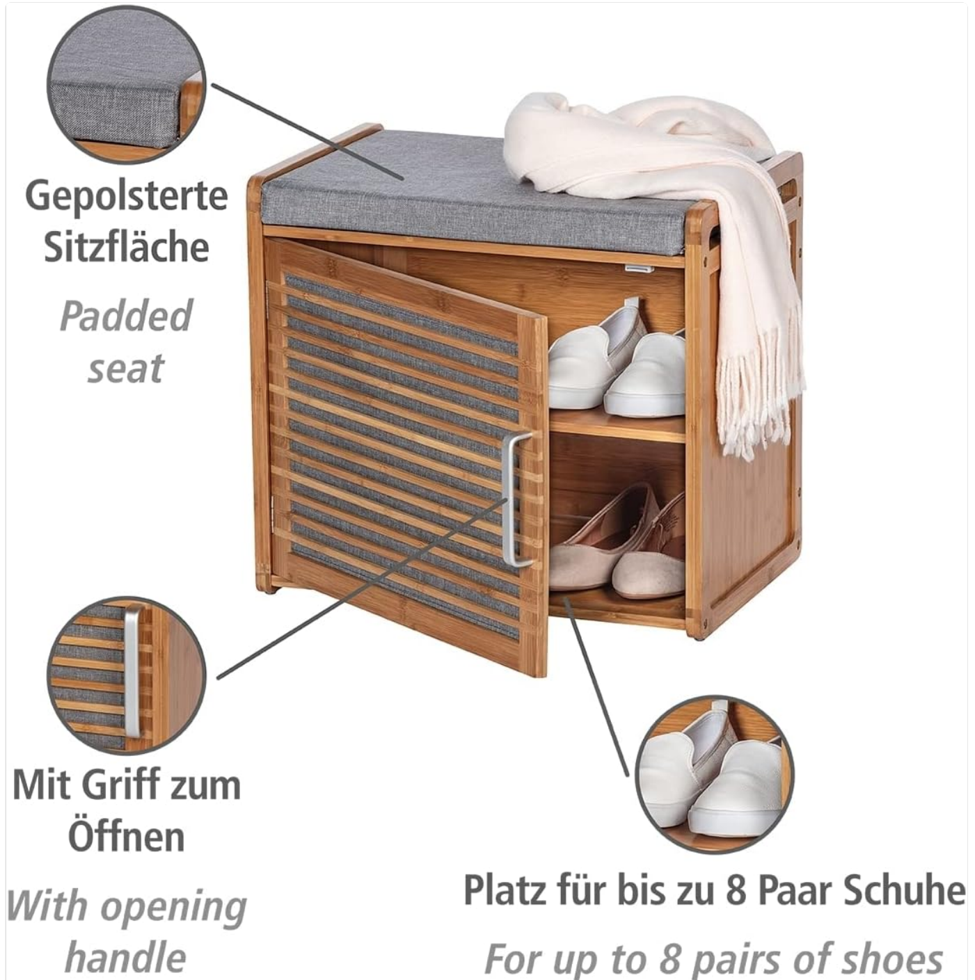
Image: A detailed view highlighting the key features of the shoe bench: the comfortable padded seat, the handle for opening the door, and the internal shelves designed to store shoes. Note: While the image indicates space for up to 8 pairs, the product description specifies up to 4 pairs.