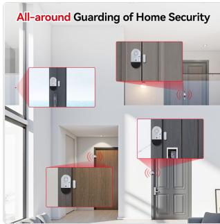
Figure 8: Mode 3: 100dB Chime for Entry Notification

Your browser does not support the video tag. Please update your browser.