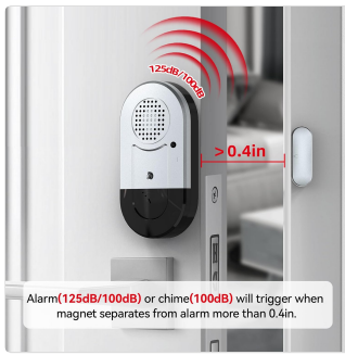
Figure 7: Mode 2: 100dB Alarm for Child Safety