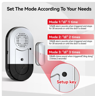
Figure 5: Mode Selection Diagram