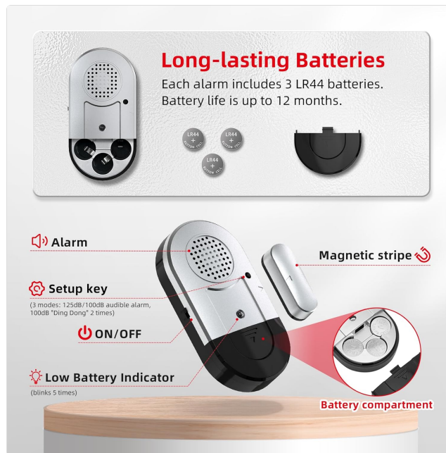
Figure 2: Battery Compartment and LR44 Batteries