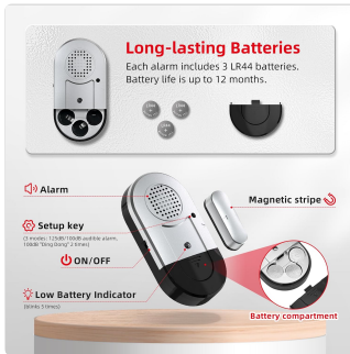
Figure 1: Alarm Unit Components

Main Alarm Unit: Contains the speaker, ON/OFF switch, setup key, and low battery indicator.