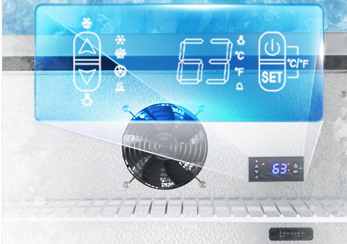
Image: Digital control panel for temperature and light settings.