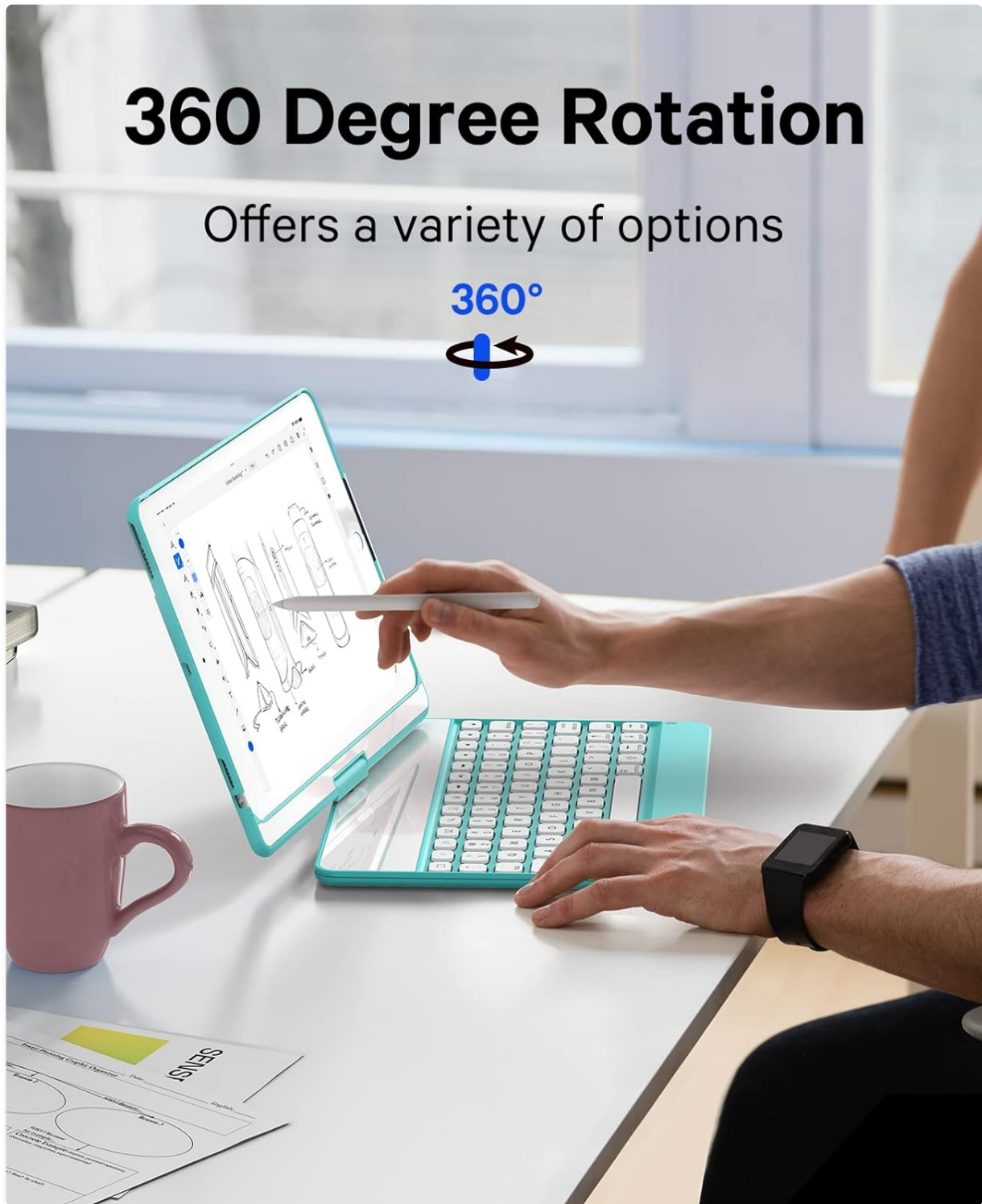
Image: The keyboard case showcasing its 360-degree rotation for versatile viewing.

This enables various modes such as laptop, presentation, video, and tablet mode.