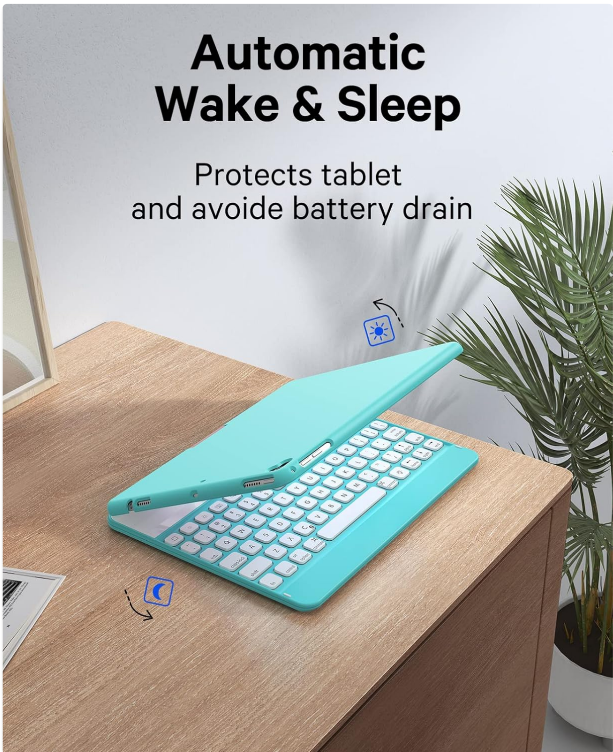
Image: The automatic wake and sleep feature of the case, designed to protect the tablet and prevent battery drain.

Protects tablet and avoids battery drain