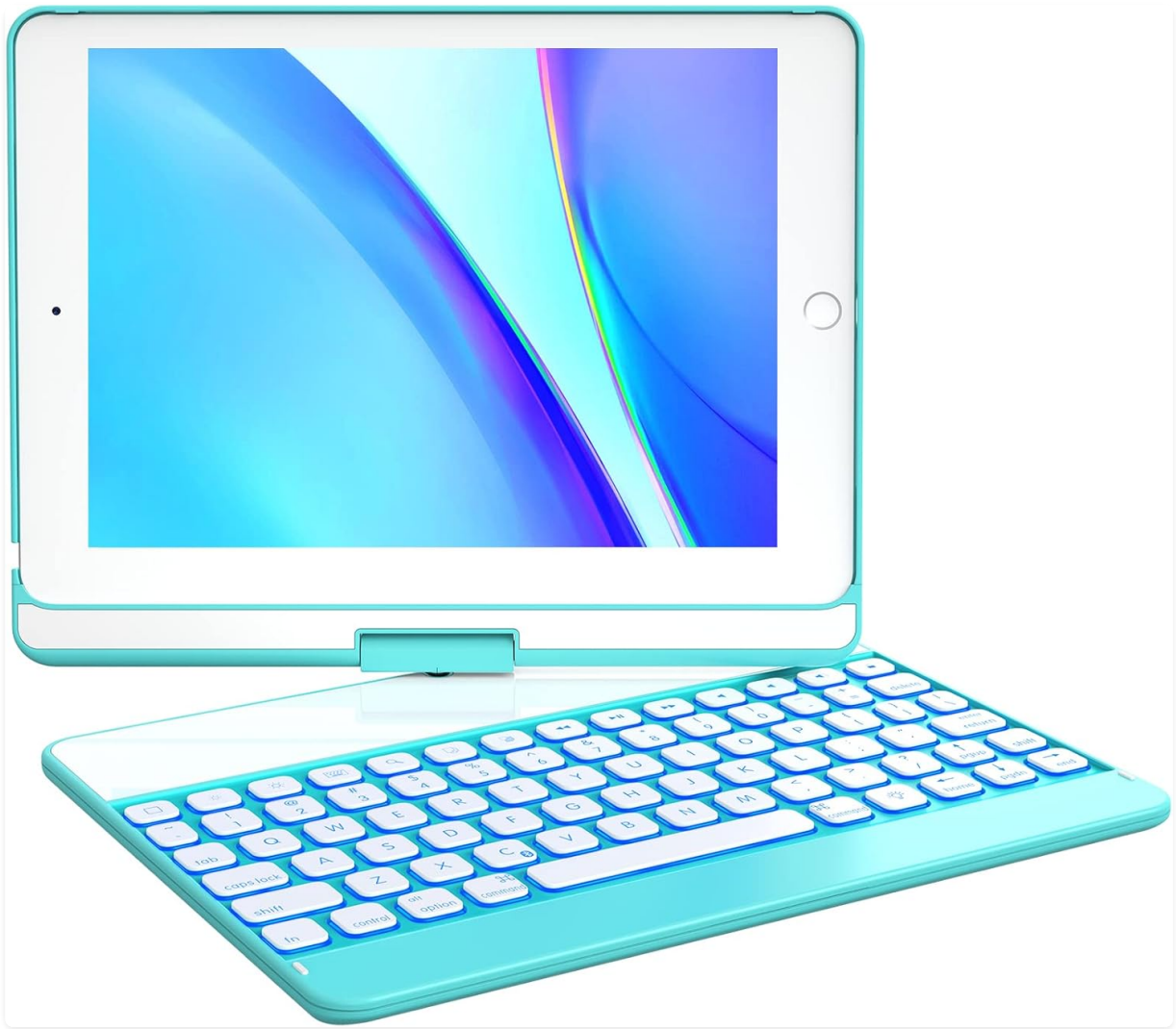
Image: The Earto Wireless Keyboard Case in its primary laptop configuration, showcasing the integrated keyboard and iPad display.