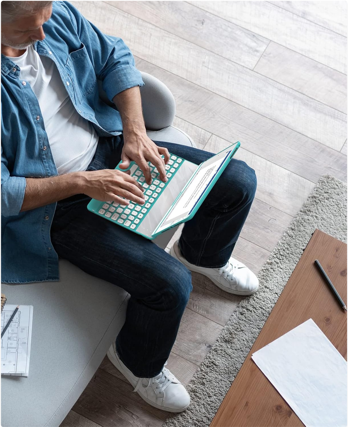
Image: A user engaging with the keyboard case, highlighting its ergonomic design for extended typing sessions.