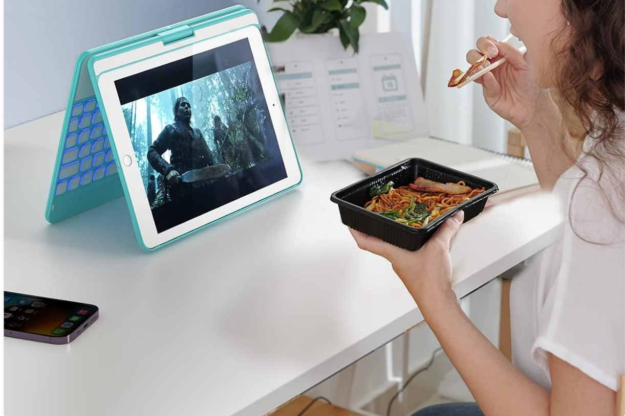
Image: The keyboard case illustrating its 180-degree flip function, ideal for tablet use.