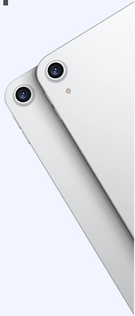
Image: A visual guide detailing the compatible iPad models and their specific model numbers for the Earto Keyboard Case.