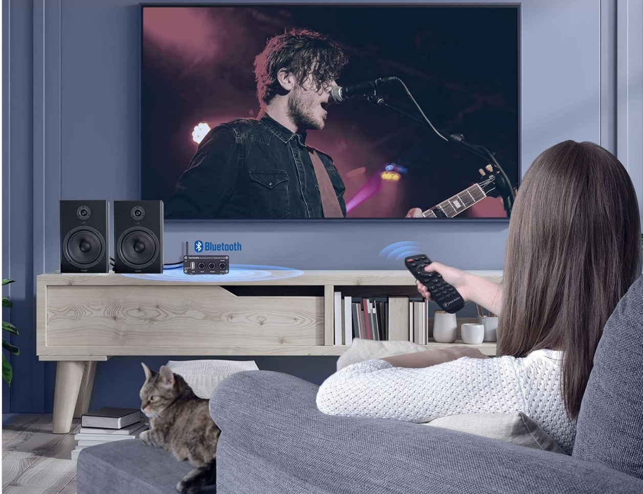
Figure 2: Remote Control Functions for the BL20A Amplifier.