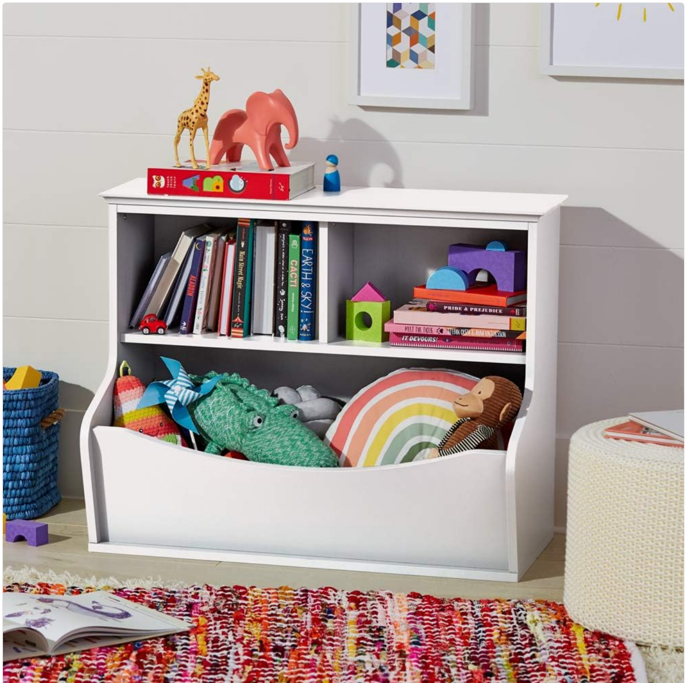
Image: The Amazon Basics Children's Multi-Functional Bookcase and Toy Storage Bin shown in a room setting, demonstrating its use for storing books and various toys.