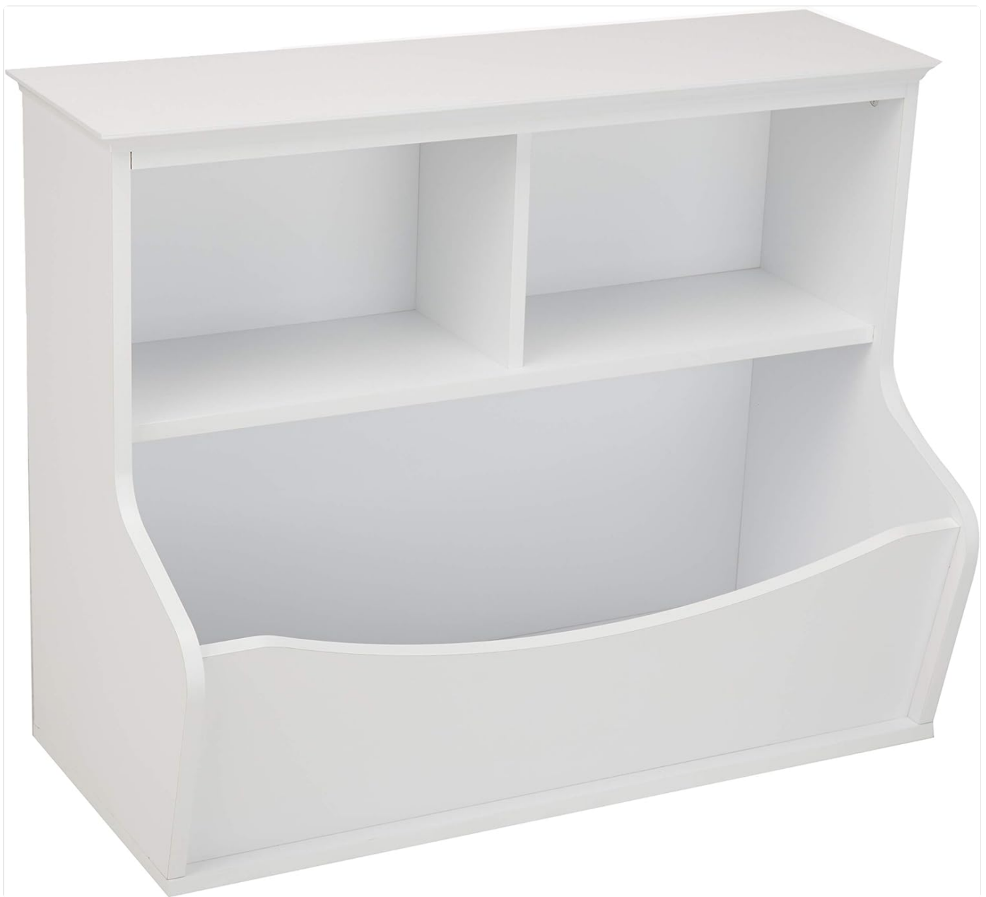
Image: An assembled view of the Amazon Basics Children's Multi-Functional Bookcase and Toy Storage Bin, showcasing its three shelves and lower toy bin.