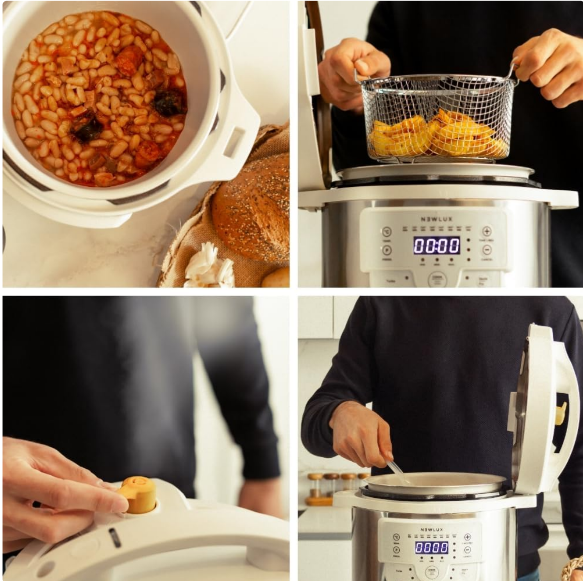
Image: Various cooking scenarios and components of the NEWCOOK Delicious Pressure Cooker.

The cooker includes a voice guide in Spanish that assists you through each step of the cooking process. A MUTE function is also available if you prefer to disable the voice prompts.