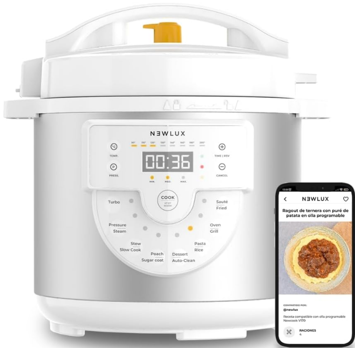
Image: Front view of the NEWCOOK Delicious Pressure Cooker showing the control panel. The control panel features an intuitive display and various buttons for selecting cooking functions, adjusting time and temperature, and managing settings.