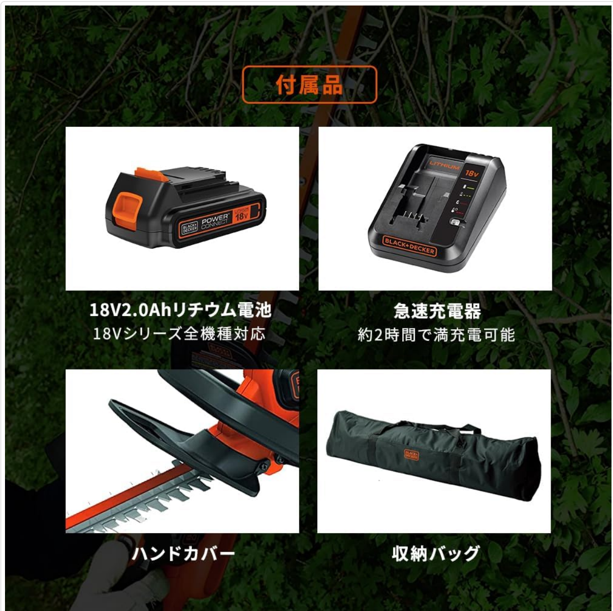
Figure 1: Included Accessories