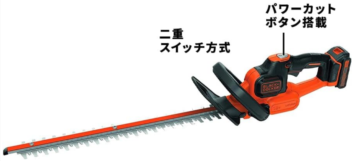
Figure 2: Product Components