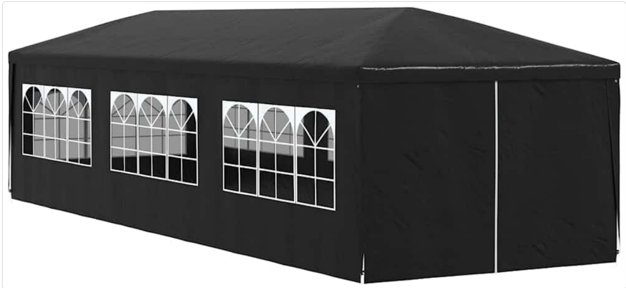
Image 2.1: The vidaXL Party Tent 3x9 m in anthracite black, shown fully assembled in a garden. The tent features multiple side windows and a main entrance.