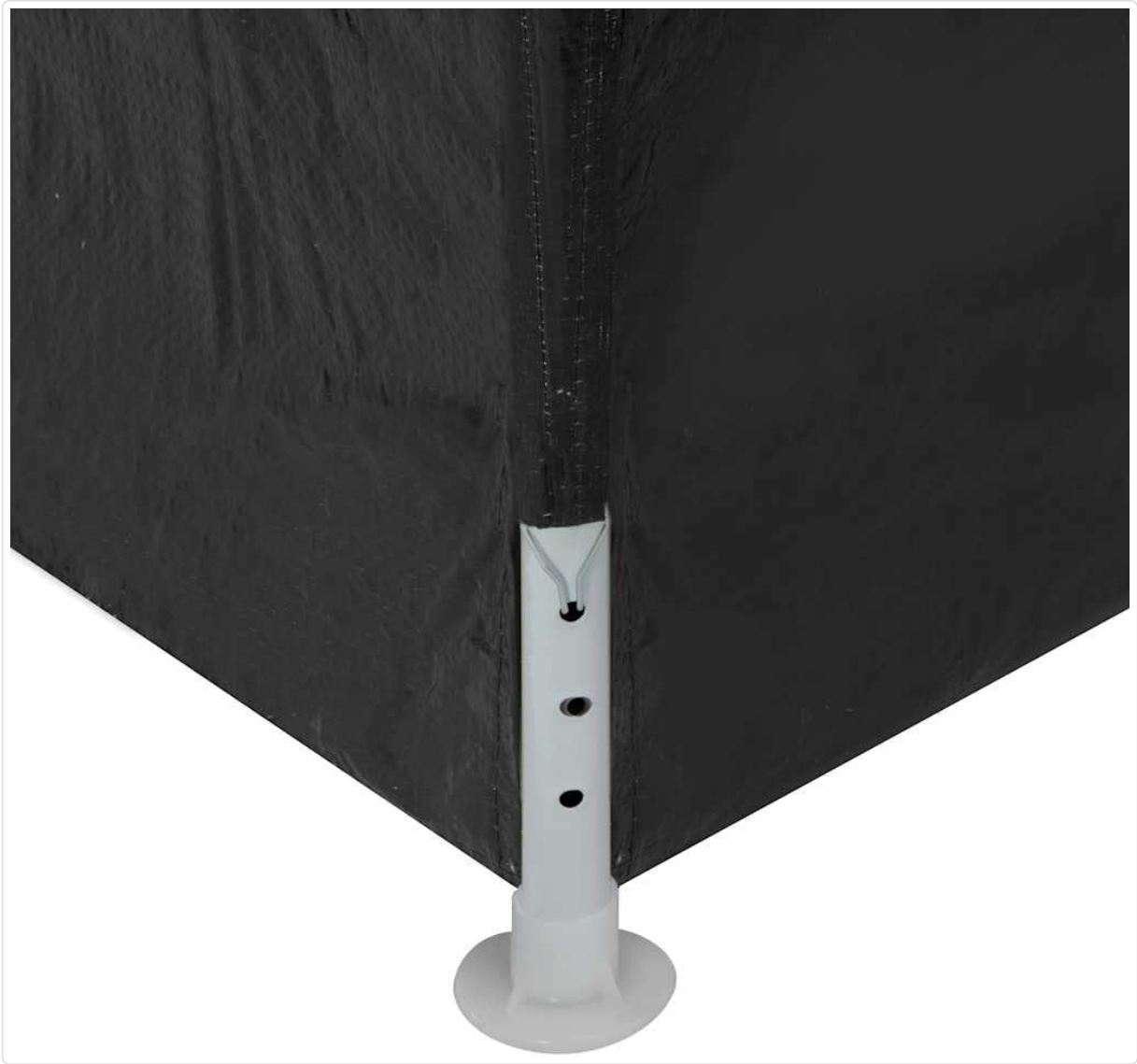
Image 3.2: Detail of the tent's foot base, showing how the fabric is secured to the vertical pole and base for stability.