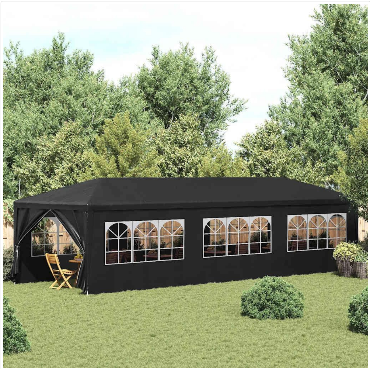
Image 4.2: The party tent with an open entrance, showing the interior space and a chair with a small table.