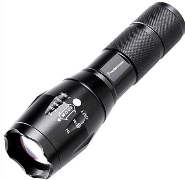
Figure 1: POCKETMAN Tactical LED Flashlight, showing its compact design and textured grip.

The POCKETMAN Tactical LED Flashlight is a compact and powerful illumination tool designed for various applications, from outdoor activities to emergency situations. It features a durable aluminum alloy construction, adjustable focus, and multiple lighting modes.