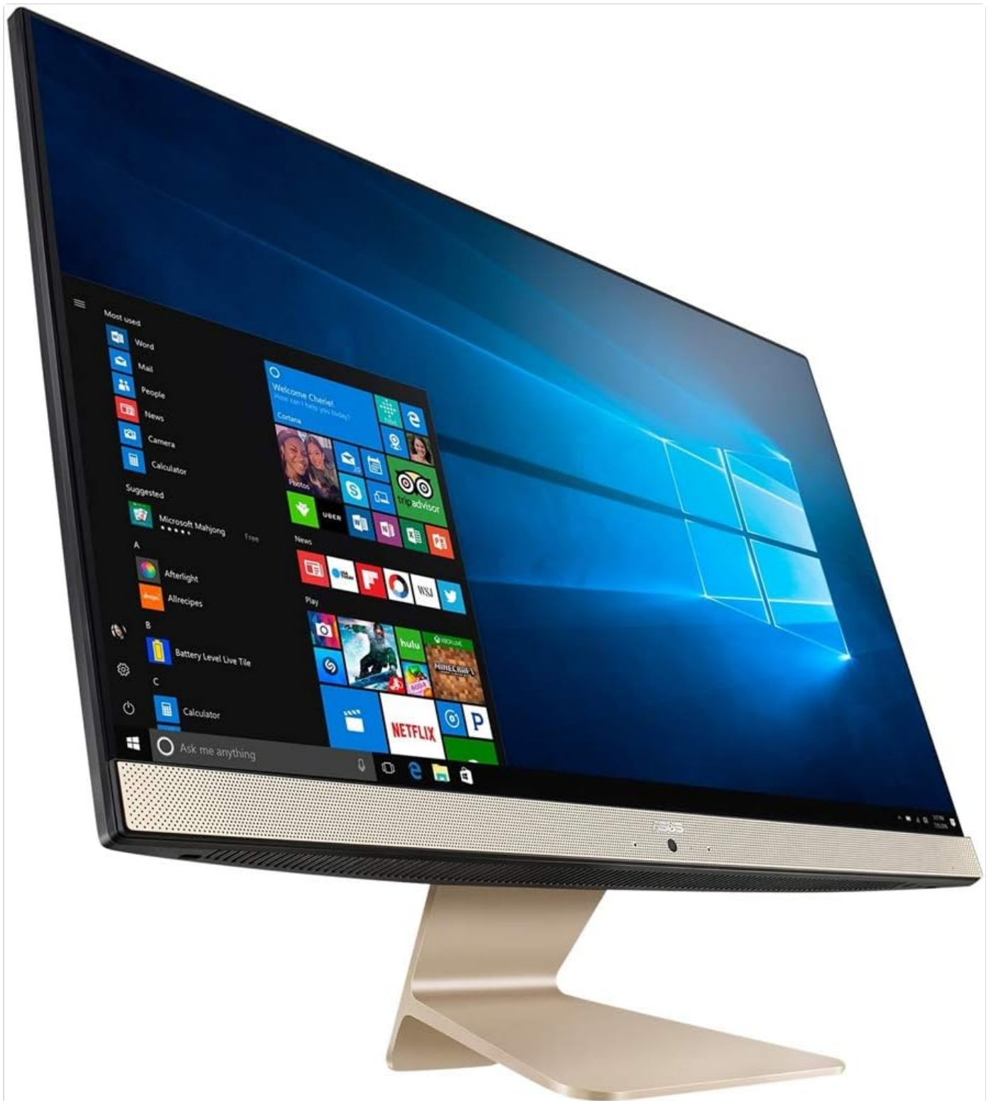
Figure 2: Side view of the ASUS Vivo AIO V241FA-DS501T, highlighting its slim profile and connectivity options.

The ASUS Vivo AIO V241FA-DS501T features multiple ports for connectivity: