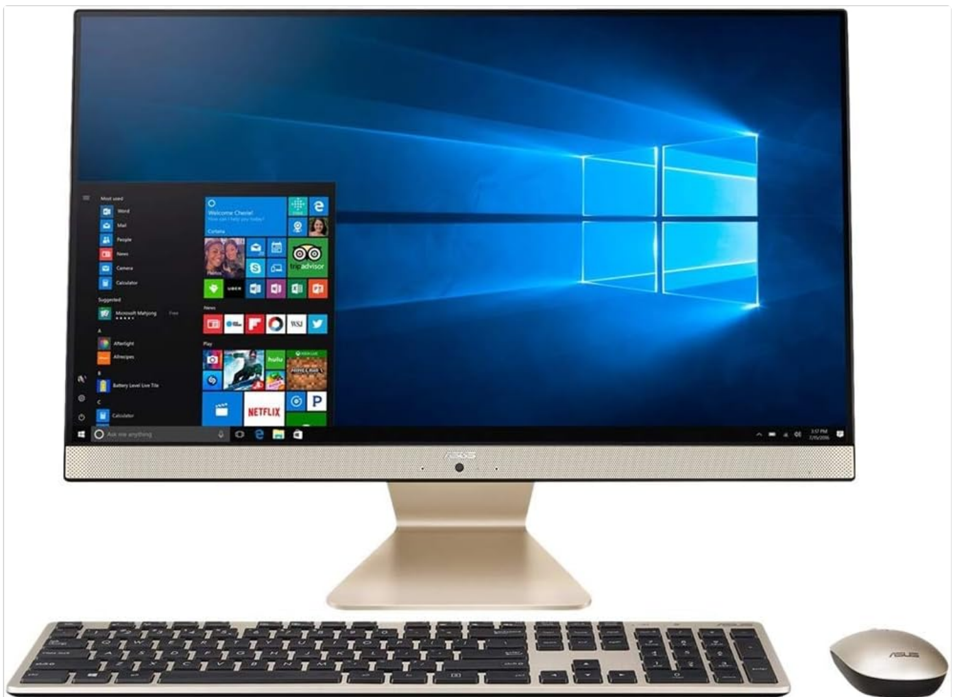
Figure 1: Front view of the ASUS Vivo AIO V241FA-DS501T All-in-One PC, showcasing its 23.8-inch Full HD touch display and included wireless keyboard and mouse.

This manual provides essential information for setting up, operating, maintaining, and troubleshooting your ASUS Vivo AIO V241FA-DS501T All-in-One Desktop PC. Please read this manual thoroughly before using your device to ensure optimal performance and longevity.