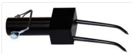
Figure 3.1: Front view of the Gundlach No. 747 Double Stretcher Hook Attachment. This image shows the main body of the attachment

The Gundlach No. 747 Double Stretcher Hook Attachment is an innovative, lightweight tool designed to facilitate carpet stretching from the floor. Its double prong design provides superior grip on Oriented Strand Board (OSB) and similar subfloors, eliminating the need for cumbersome tubes, tail block assemblies, and heavy carrying cases.