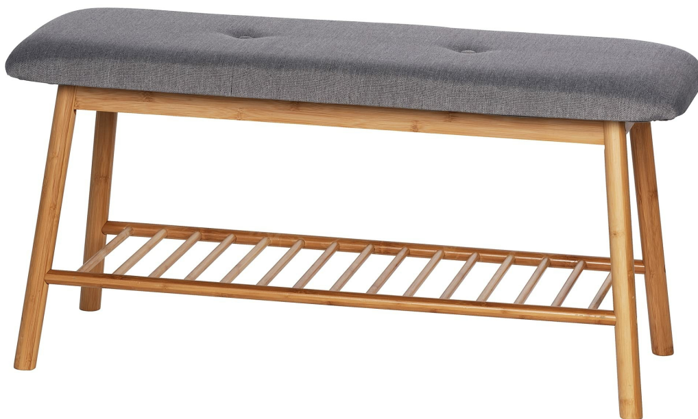
Image 1.1: The WENKO Entryway Bench with Shoe Storage in an entryway setting.

The bench features a comfortably padded seat, perfect for putting on or taking off shoes. Below the seat, an attractive rack provides space for up to four pairs of shoes. The grey seat surface is made from an easy-to-clean polyester/cotton mix.