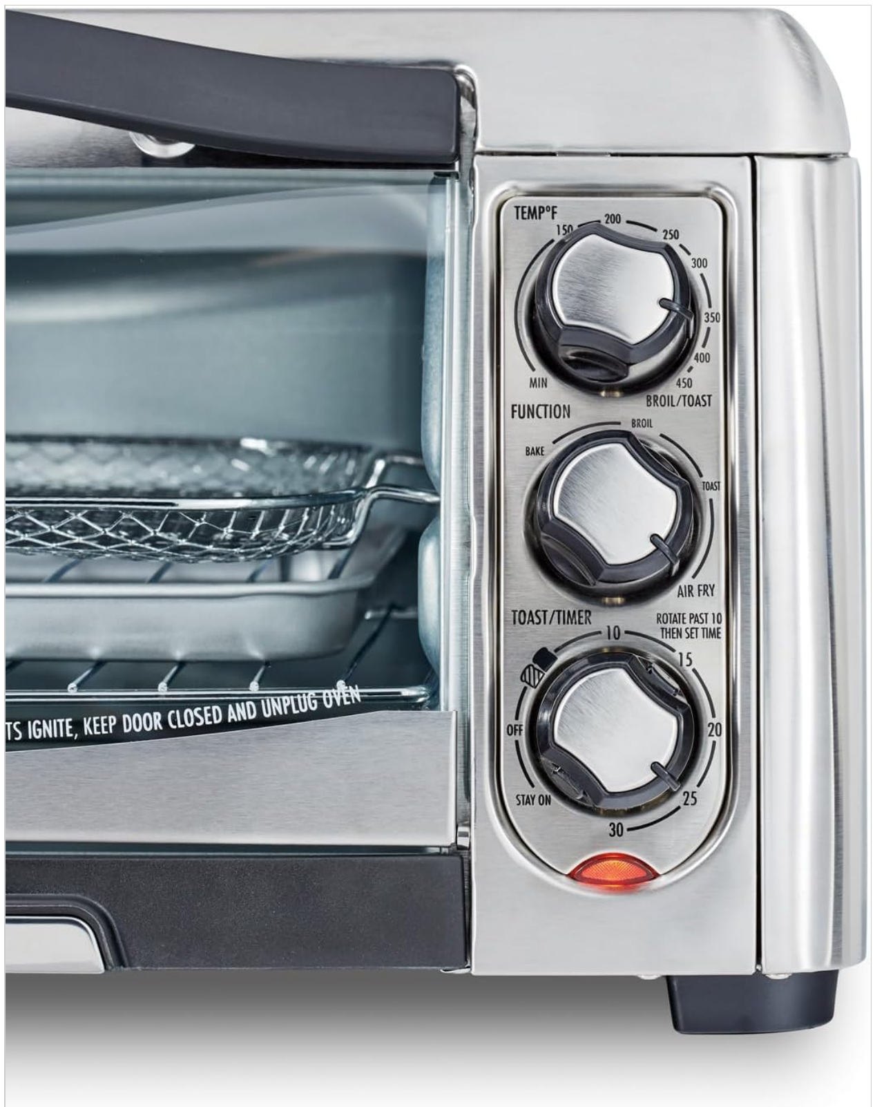
Illustration of the Sure-Crisp air circulation technology within the oven for even cooking.