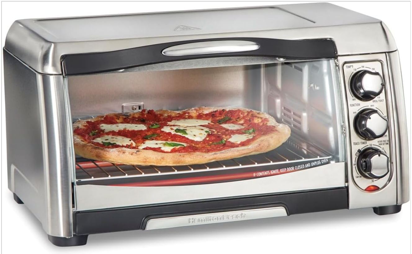
Front view of the Hamilton Beach Air Fryer Toaster Oven, showcasing its stainless steel exterior and glass door.

The Hamilton Beach Air Fryer Countertop Toaster Oven (Model 31323) is a versatile kitchen appliance designed for air frying, baking, broiling, and toasting. Its compact stainless steel design fits easily on most countertops, offering multiple cooking functions to prepare a variety of meals and snacks.