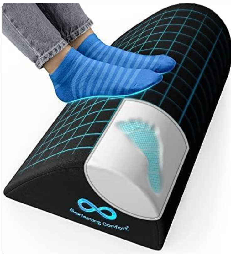
The Everlasting Comfort Memory Foam Foot Rest in black, designed for ergonomic support.

The Everlasting Comfort Memory Foam Foot Rest is designed to provide ergonomic support and comfort for your feet and legs, whether you are working at your desk, gaming, or relaxing at home. Its unique teardrop shape and premium memory foam construction promote better posture and reduce fatigue during long periods of sitting.