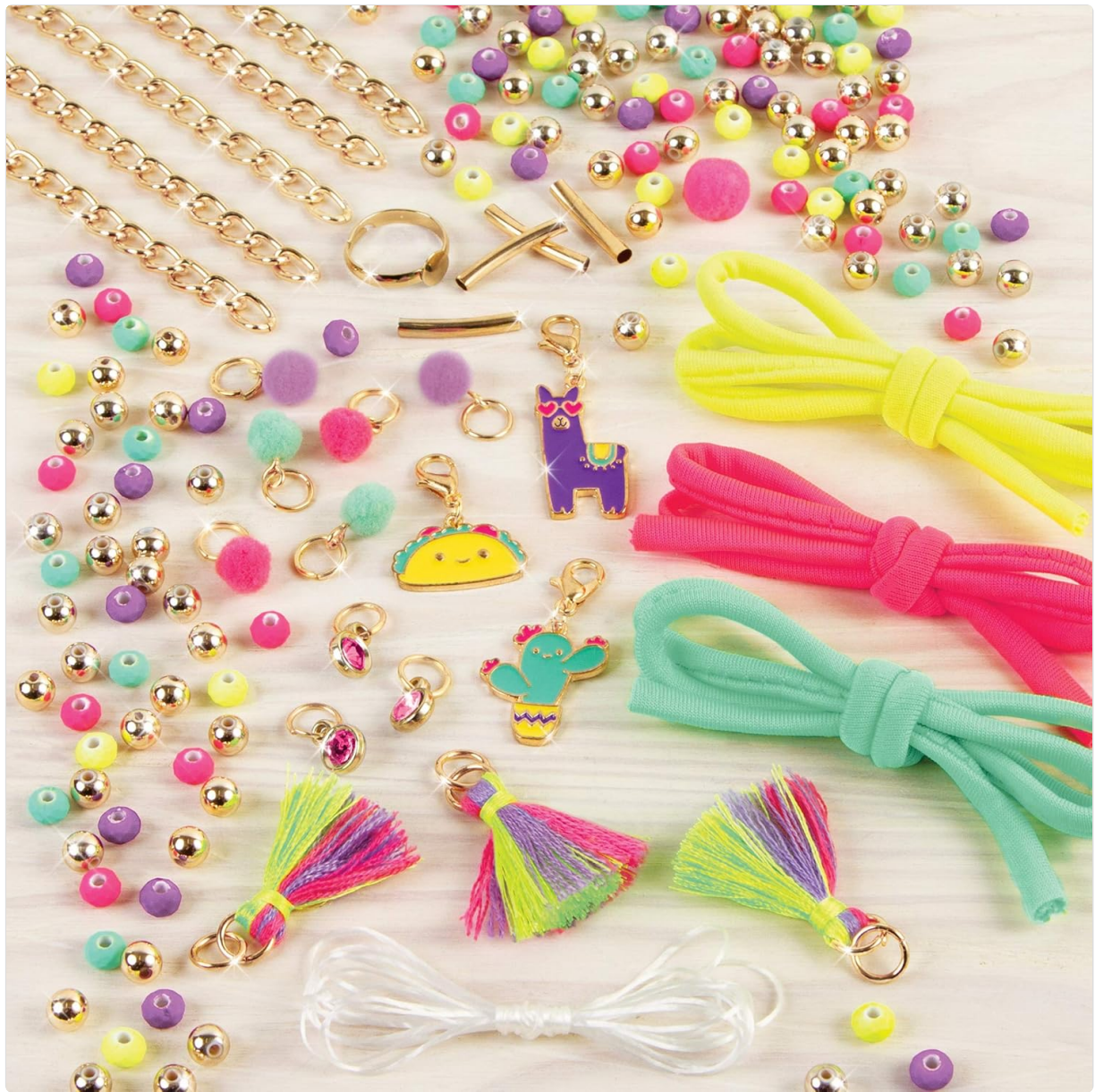
Image: Contents of the Neo-Brite Chains & Charms Kit, showing beads, chains, cords, tassels, and charms.