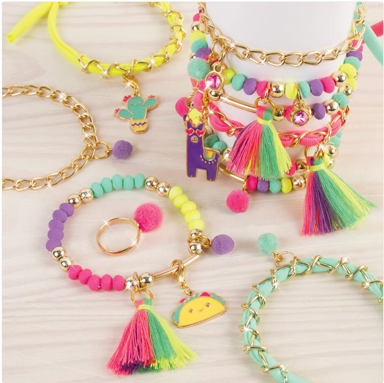
Image: Examples of completed bracelets from the Neo-Brite Chains & Charms Kit, showcasing various designs and components.