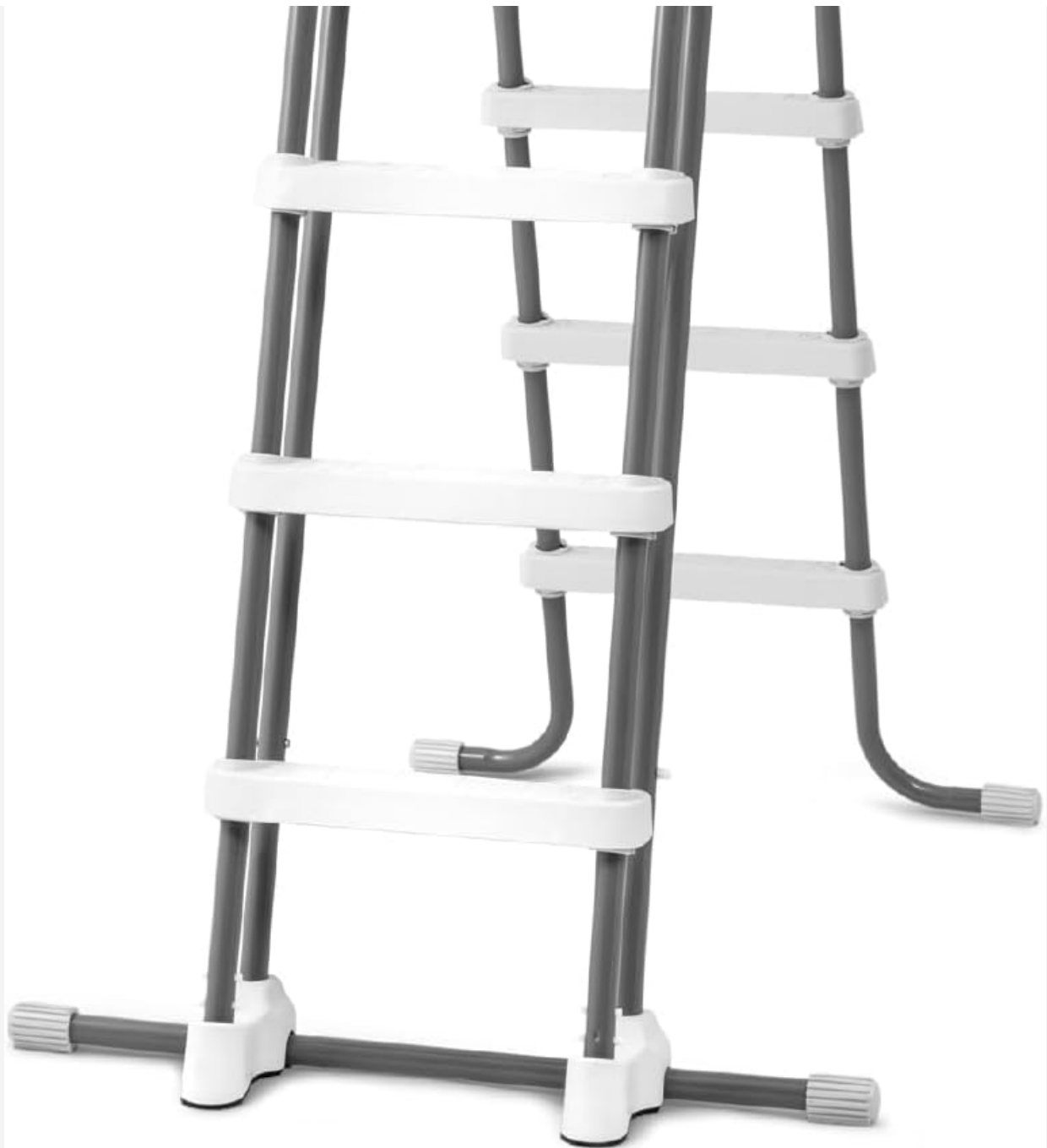
Image 1.1: The Intex 28077E Heavy Duty Deluxe Pool Ladder, showcasing its sturdy design and white steps against a gray frame.