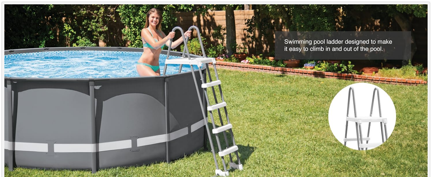
Image 4.1: A person demonstrating the adjustment or installation of the ladder steps, highlighting the high-impact, slip-resistant design.