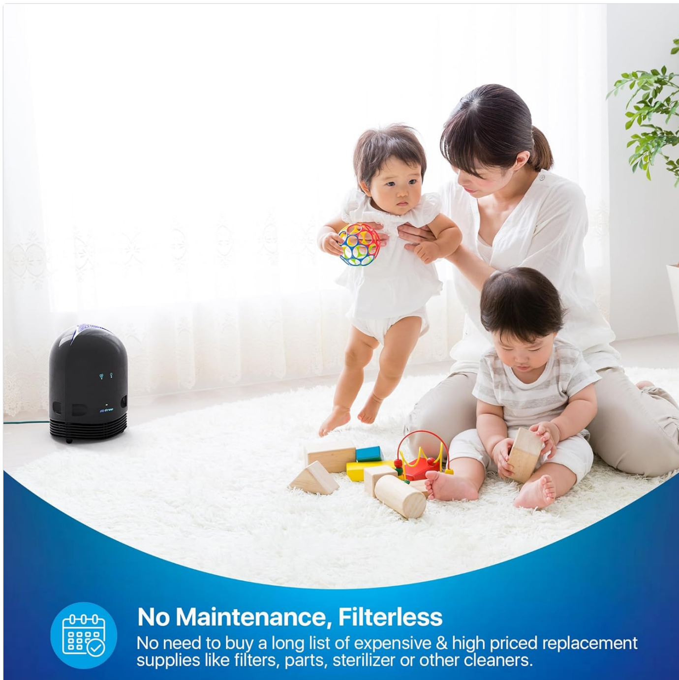
Figure 3: The Airfree P3000 Plus in a living space, emphasizing its filterless and maintenance-free operation, which saves time and money.