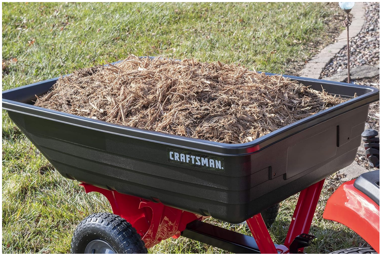
Figure 4: The black poly dump cart is shown filled to capacity with wood mulch, ready to be towed.