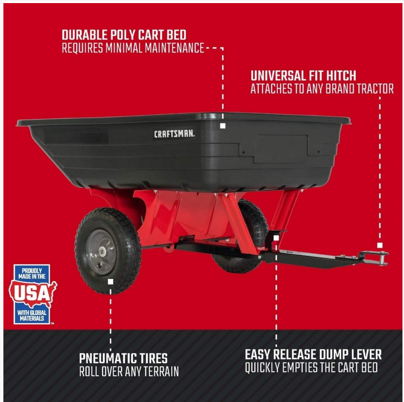
Figure 2: An annotated image of the Craftsman dump cart pointing out its durable poly cart bed, universal fit hitch, pneumatic tires, and easy release dump lever.