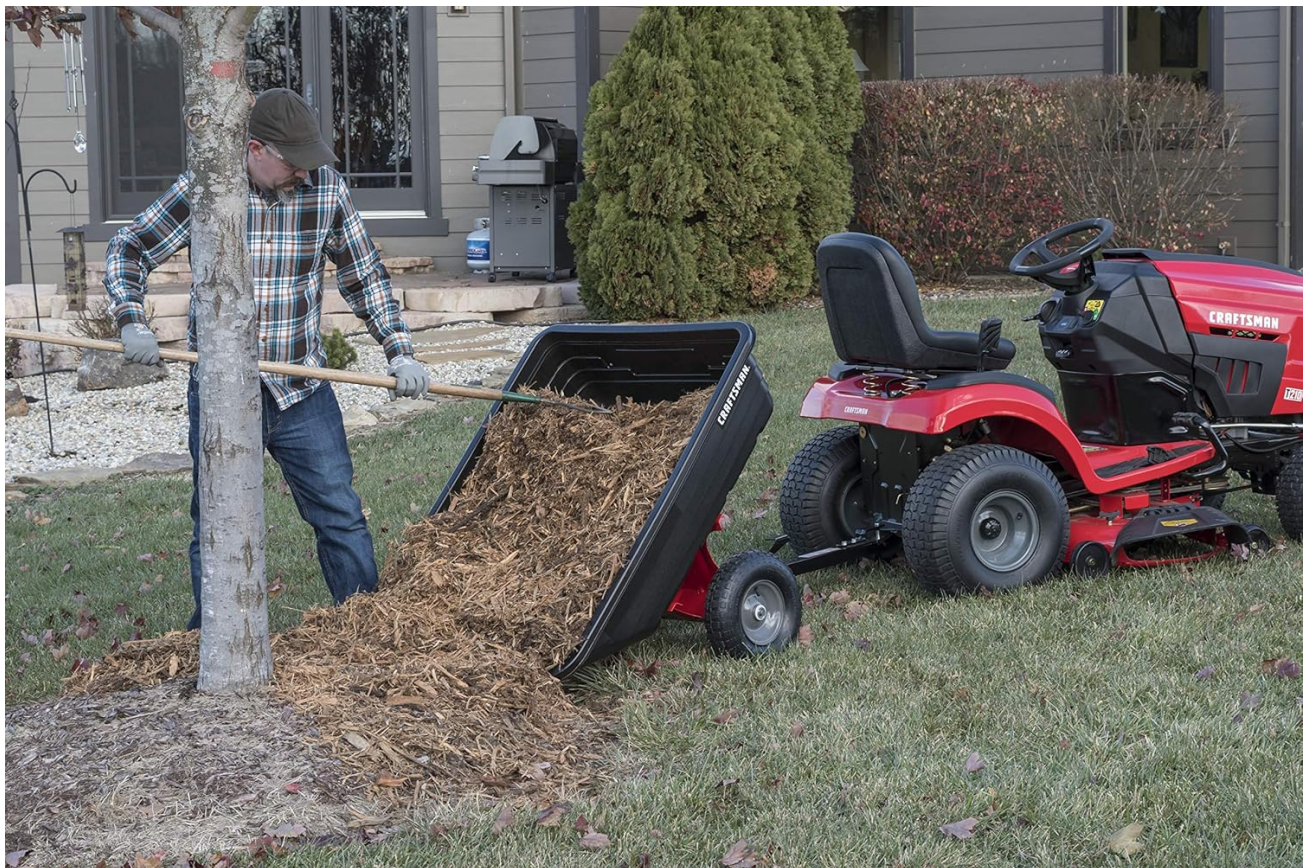
Figure 7: A side view of the Craftsman dump cart tilted to release its contents, illustrating the efficiency of the dumping mechanism.