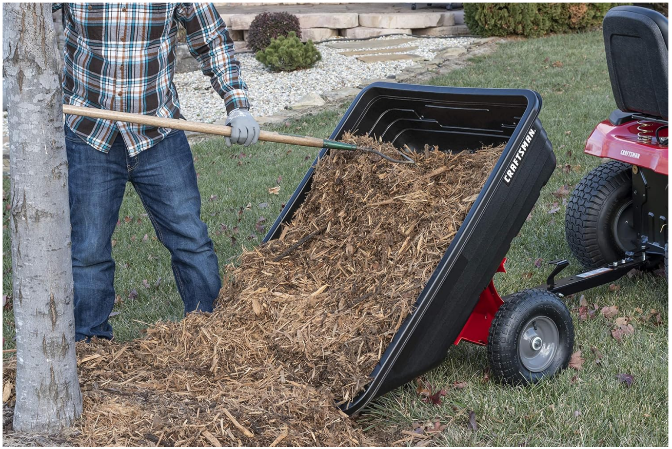
Figure 6: A person is shown using a rake to assist in dumping mulch from the tilted Craftsman cart, demonstrating the swivel dump action.