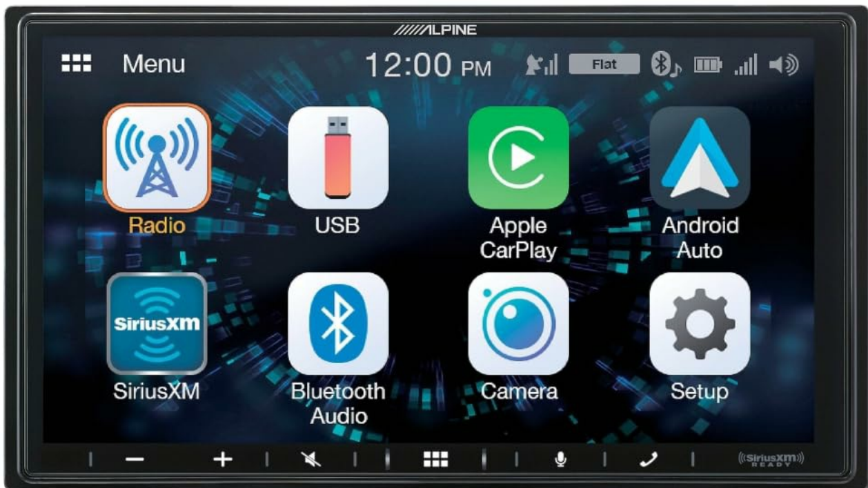
Figure 2.2.1: Front view of the Alpine iLX-W650 Digital Media Receiver, showcasing its 7-inch anti-glare capacitive touchscreen.