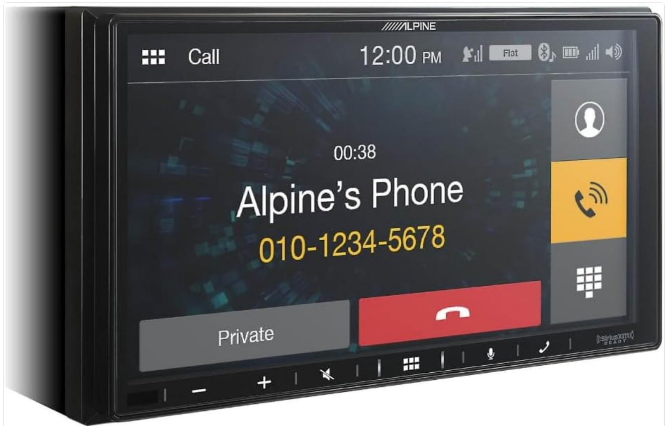
Figure 3.1.1: The Alpine iLX-W650 display showing an incoming phone call, demonstrating the clear interface for communication features.

The iLX-W650 features a 7-inch anti-glare capacitive touchscreen with intuitive swipe controls. A two-finger swipe motion (up, down, left, or right) can control volume, track skip, and other functions without needing to precisely target specific on-screen buttons.