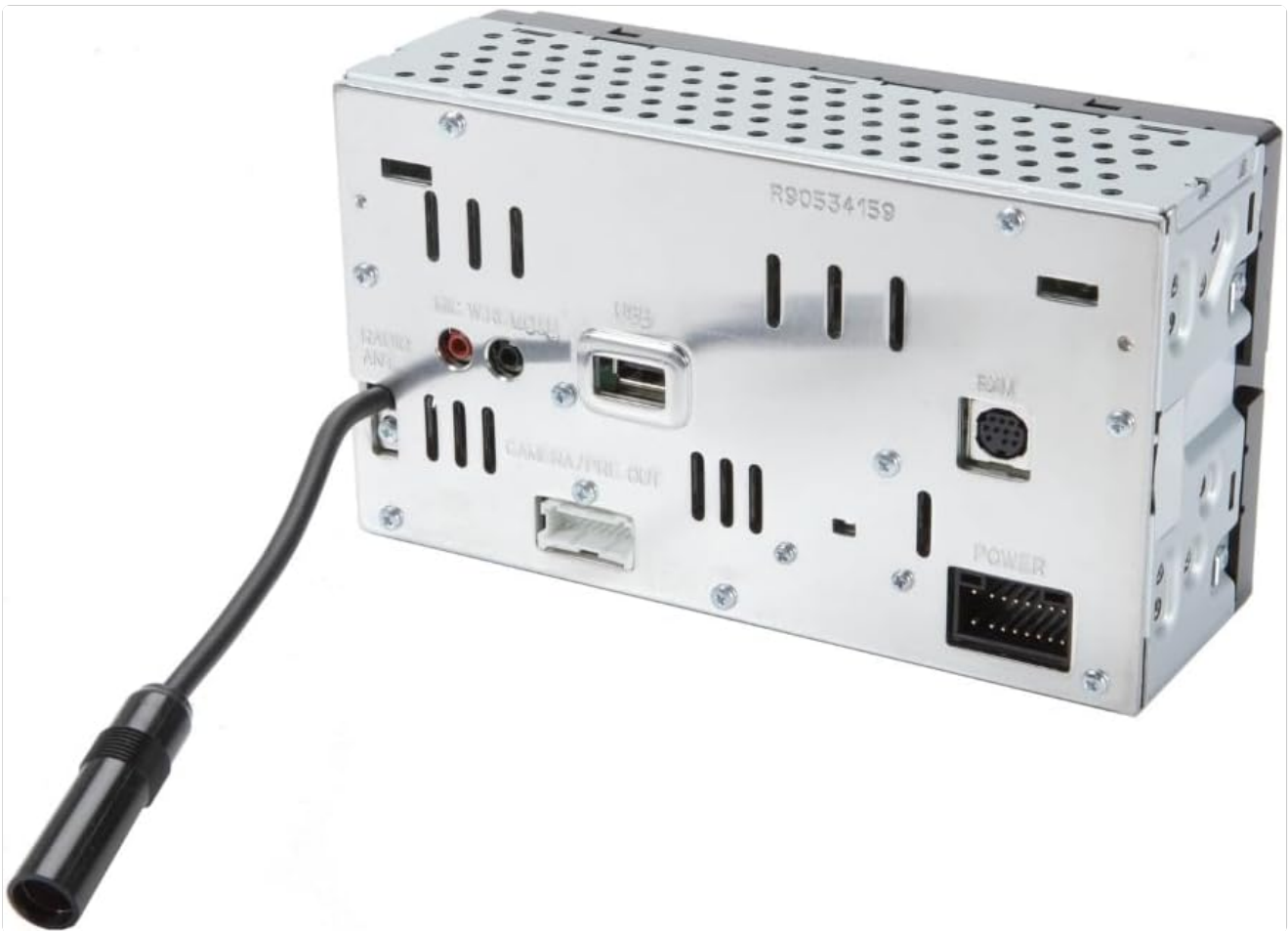
Figure 2.3.1: Rear view of the Alpine iLX-W650 showing various connection ports including USB, camera inputs, and power.