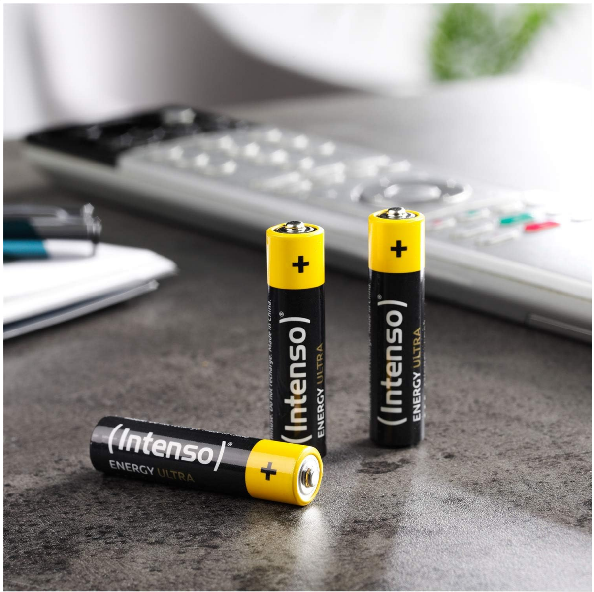
Image 3.1: Intenso AA batteries positioned near a remote control, illustrating a common application for battery installation.