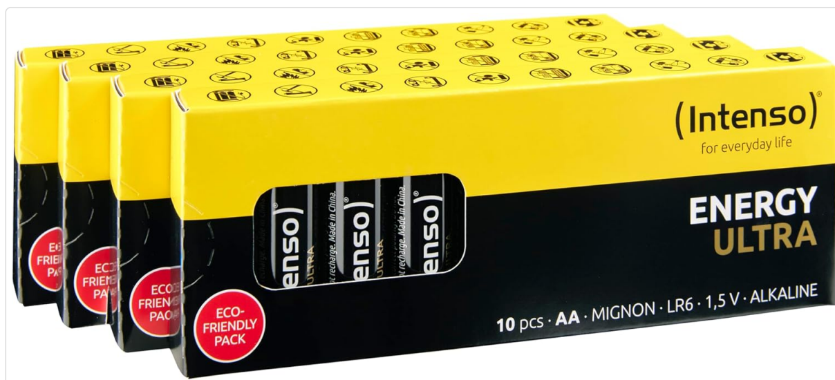
Image 5.1: Several retail boxes of Intenso Energy Ultra AA batteries, illustrating how they are typically packaged for storage and sale.