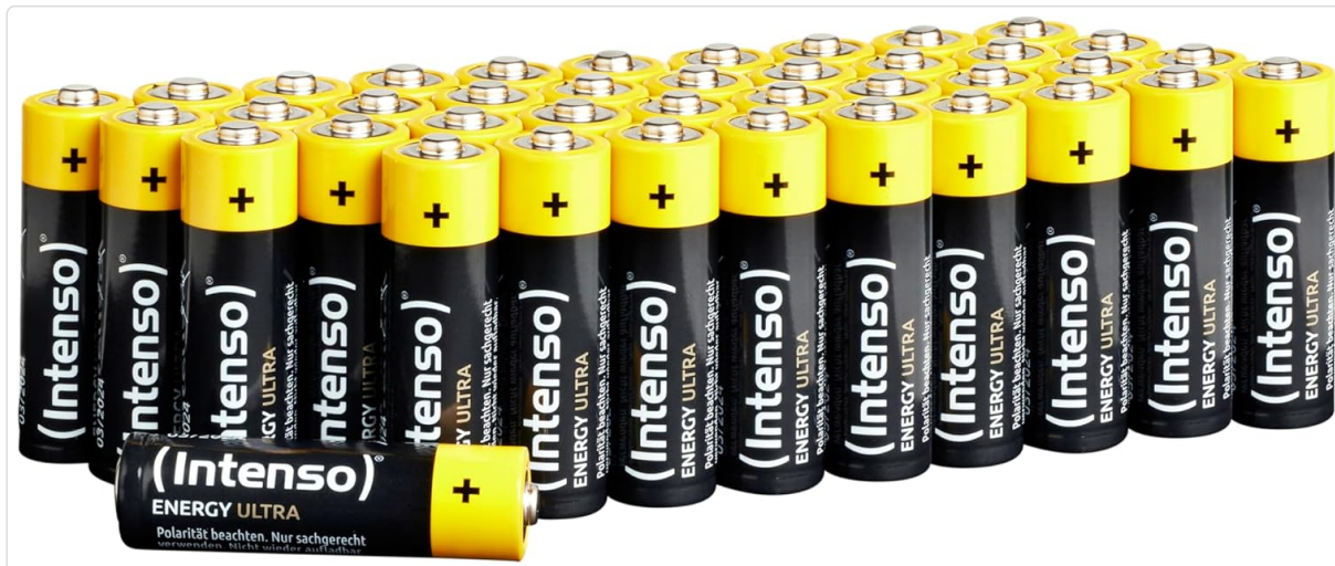
Image 1.1: A pack of 40 Intenso Energy Ultra AA Mignon LR6 Alkaline Batteries, showcasing the black and yellow design.

Thank you for choosing Intenso Energy Ultra AA Mignon LR6 Alkaline Batteries. These batteries are designed to provide reliable power for a wide range of everyday electronic devices. This manual provides important information on the safe and effective use of your batteries.