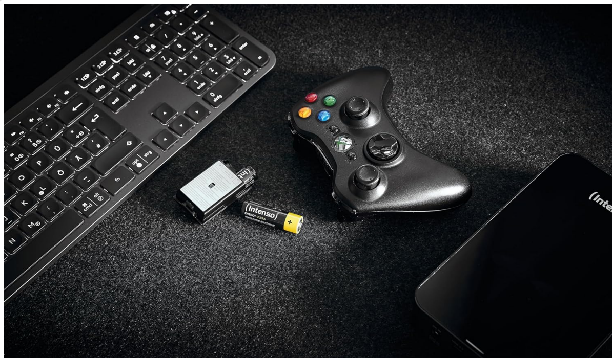
Image 4.1: An Intenso AA battery placed near a gaming controller and a wireless keyboard, demonstrating its use in common electronic peripherals.

For optimal performance, always replace all batteries in a device at the same time. When a device stops functioning, replace the batteries promptly to prevent potential leakage.