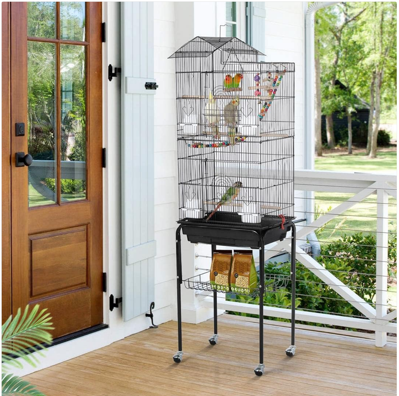
Image: The bird cage with its large front doors open, illustrating the spacious interior and accessibility.