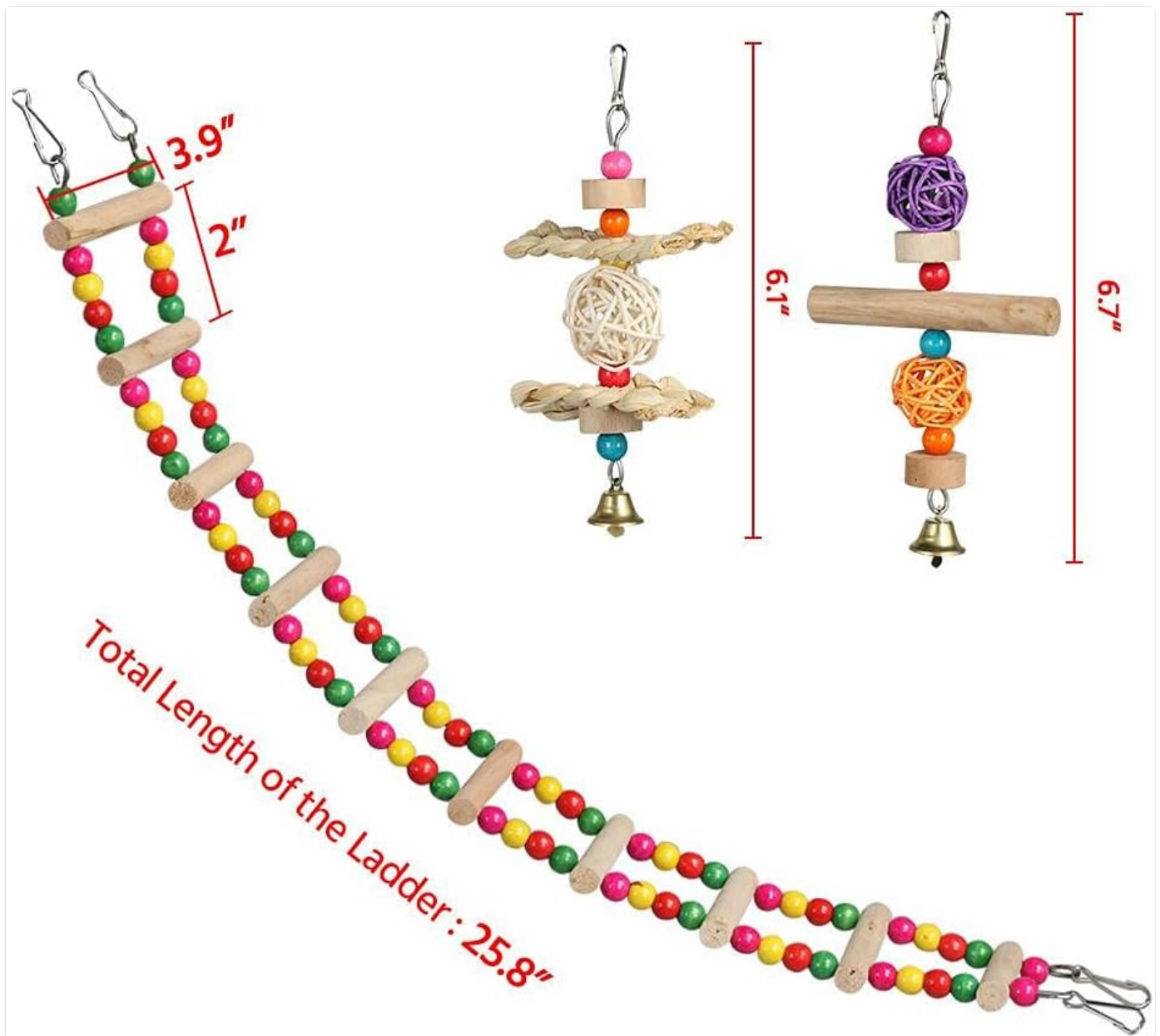
Image: The included wooden ladder and hanging toys for bird enrichment.