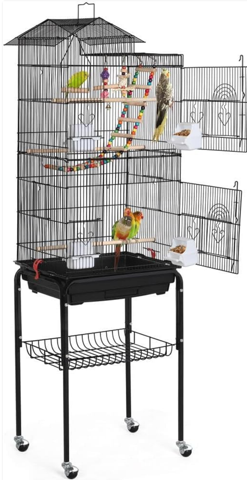
Image: Overview of the Yaheetech Bird Cage with included accessories like perches, feeders, and toys.