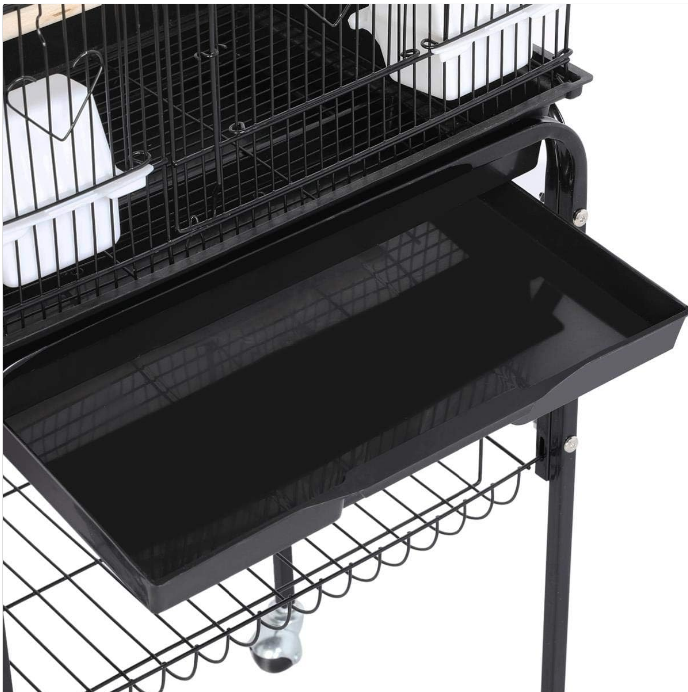
Image: Detail of the 360-degree swivel casters for easy mobility of the stand.