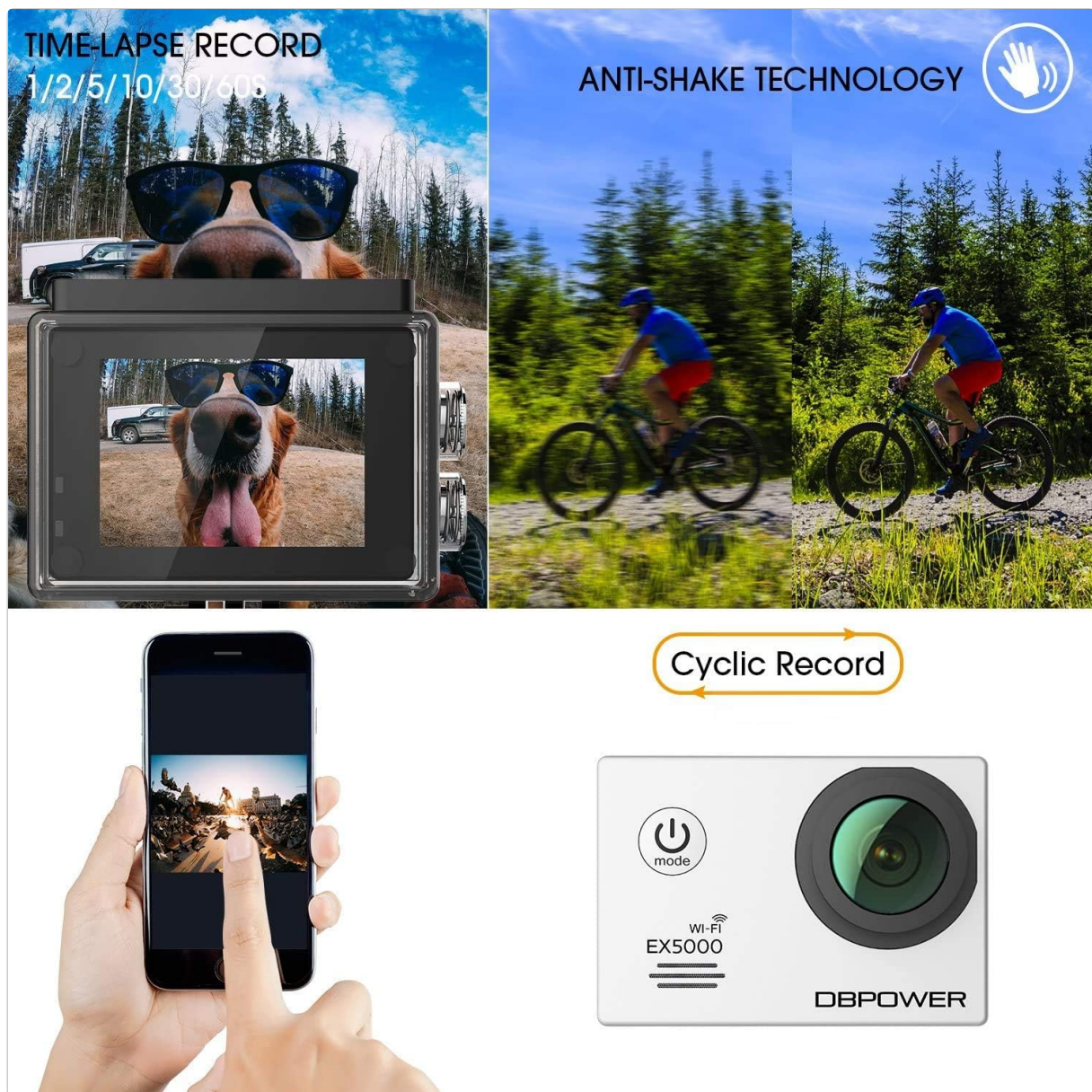
Image: Visual representation of Time-Lapse, Anti-Shake, and Cyclic Record functions.