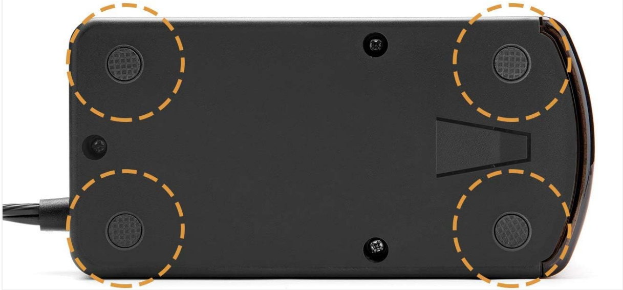
Image: Underside view of the AFMAT Electric Pencil Sharpener, showing the non-skid foot pads for stability.