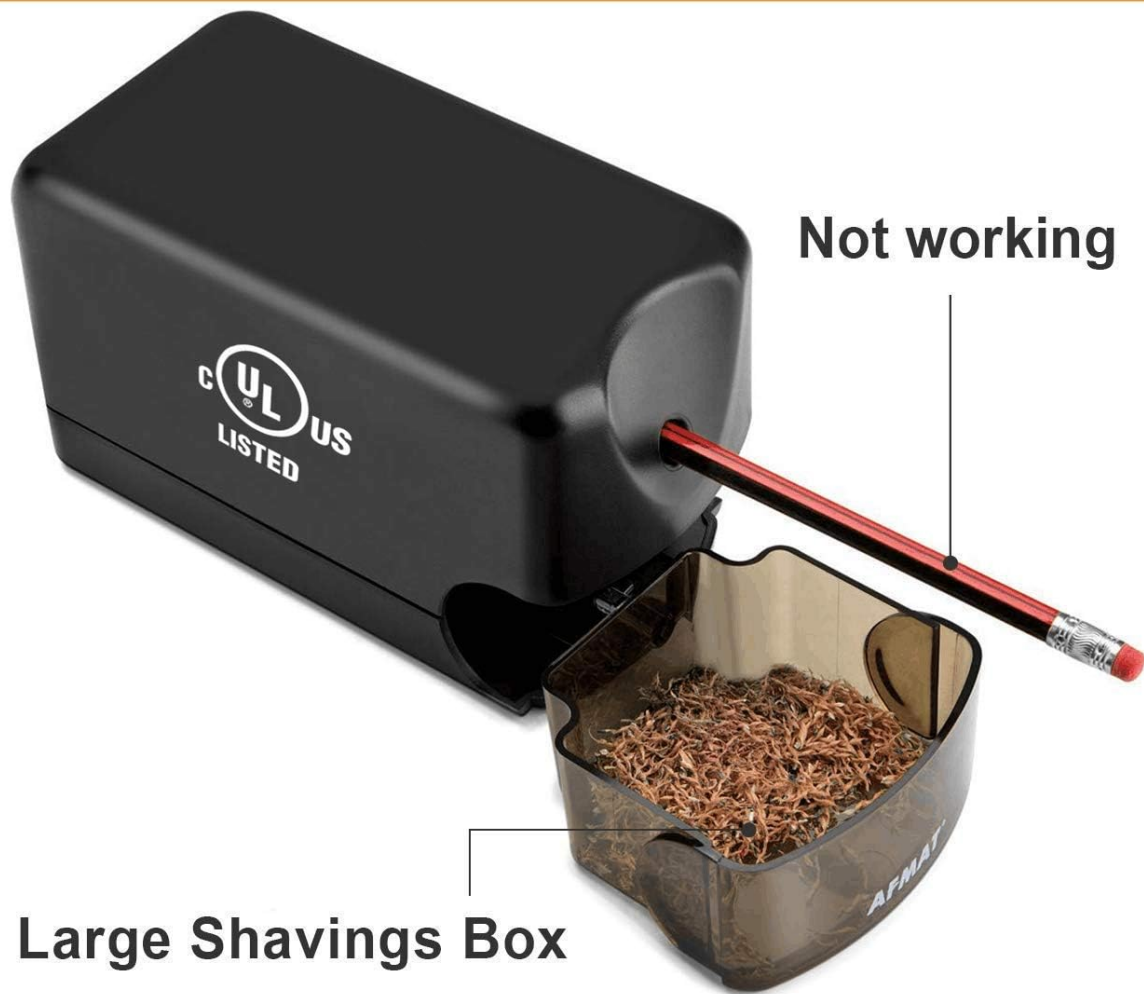
Image: The AFMAT Electric Pencil Sharpener with its large, transparent shavings box removed for emptying.