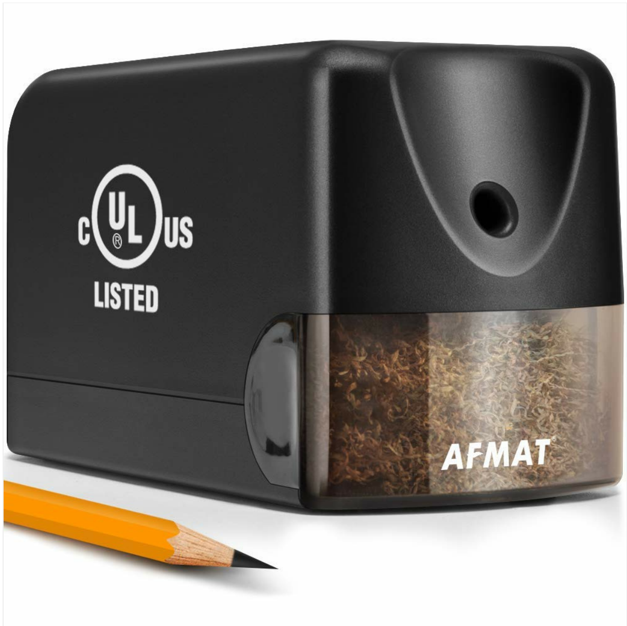
Image: The AFMAT Electric Pencil Sharpener PS13, black model, ready for use.