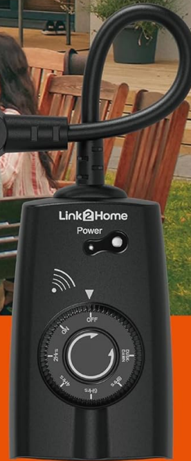
Image: An outdoor patio scene at dusk, illuminated by string lights connected to the timer unit, demonstrating the automatic activation by the photocell sensor.