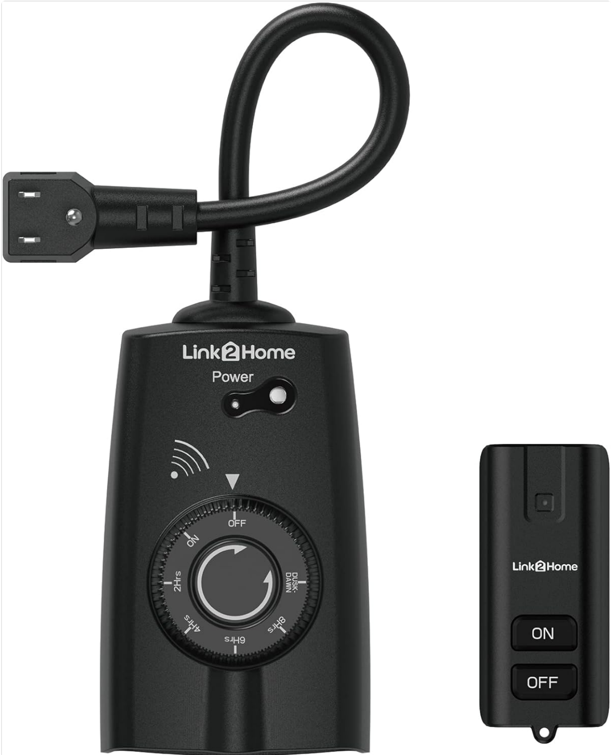
Image: The Link2Home outdoor timer unit with its power cord and two grounded outlets, shown alongside its wireless remote control.

Familiarize yourself with the components of your Link2Home outdoor timer and remote control.