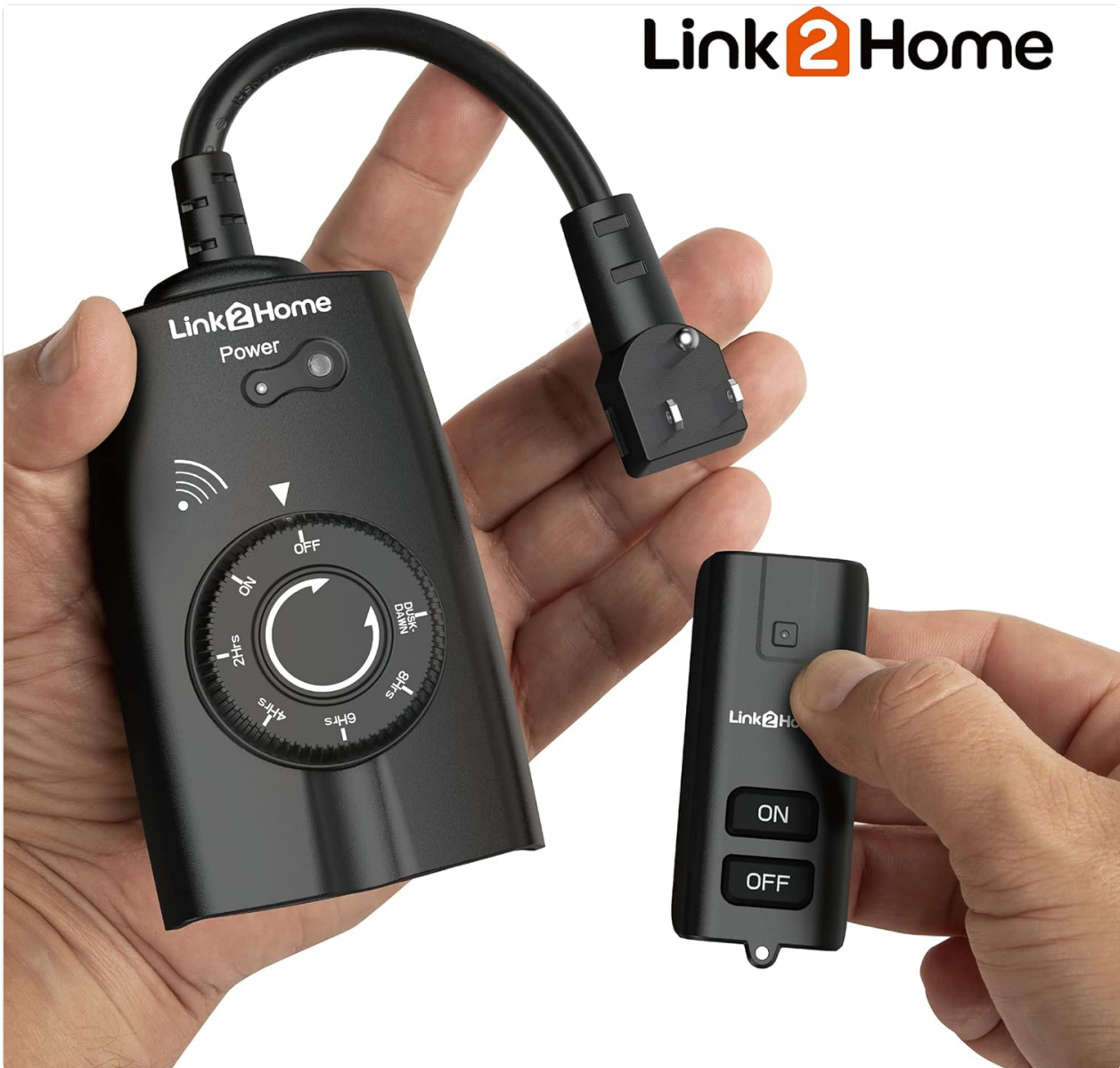
Image: A person holding both the Link2Home outdoor timer unit and its remote control, illustrating the compact size of both components.