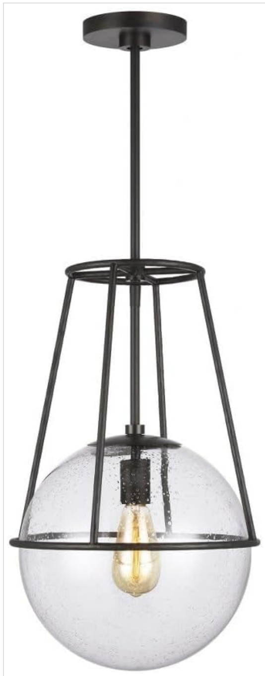
Image: Full view of the Feiss Atlas One Light Pendant, showcasing its Aged Iron finish and Clear Seeded Glass shade.