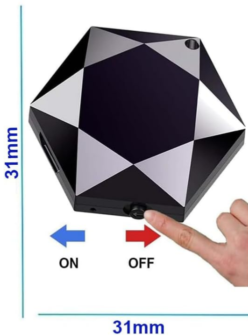
Image 5.1: Recording operation. This image highlights the ON/OFF switch on the side of the recorder, indicating how to initiate and stop recording.