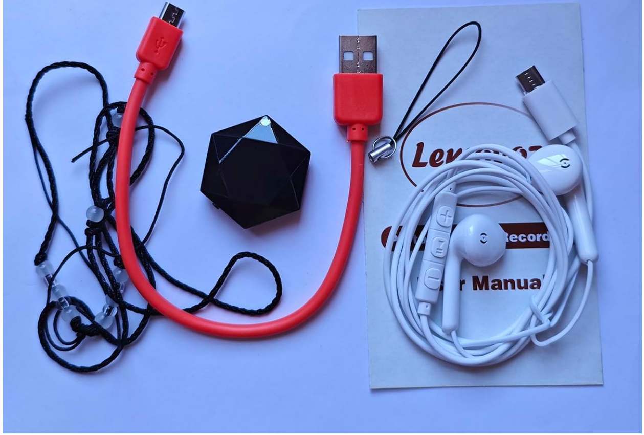
Image 3.1: Package contents. This image displays all items included with the LemoVoz LV-03: the recorder, a red USB data cable, white earphones, and the instruction manual.