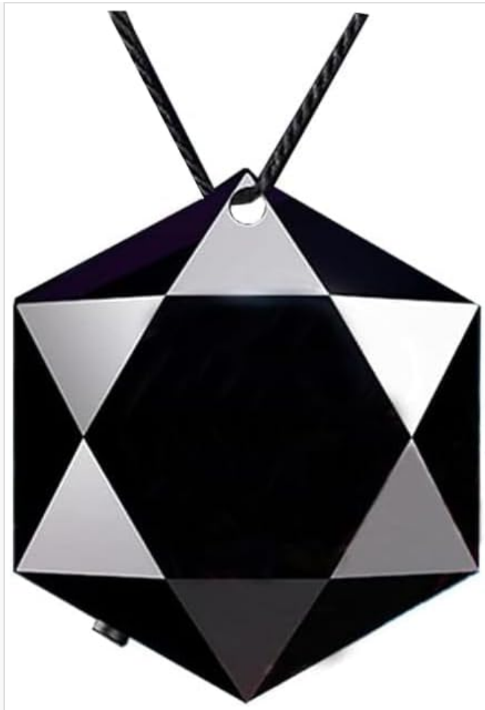
Image 1.1: The LemoVoz LV-03 Digital Voice Recorder. This compact, hexagonal device is black with reflective facets, designed for portability and discreet use.