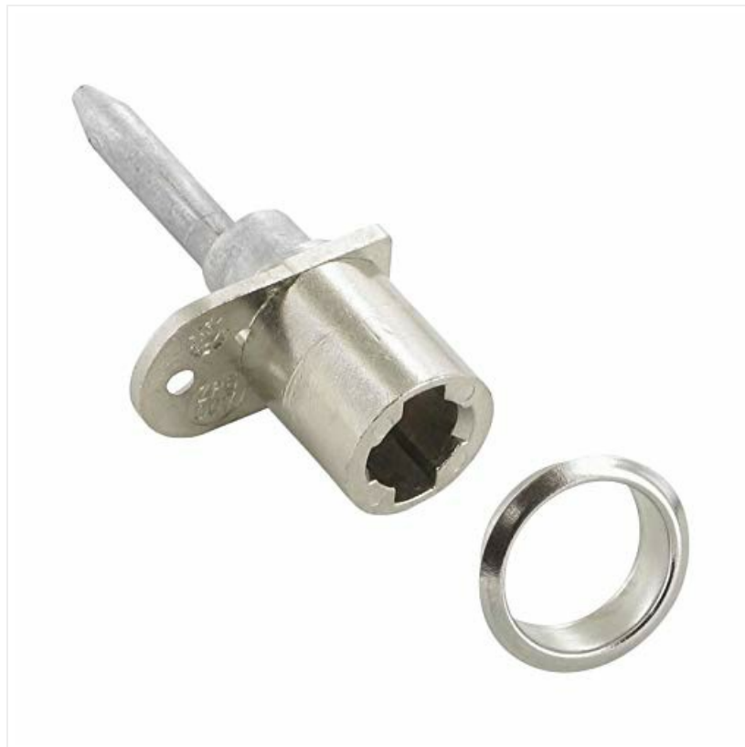
Figure 1: LEHMANN Drawer Lock (Model 0342103001). This image shows the overall appearance of the lock mechanism, highlighting its nickel finish and key entry point.

This manual provides instructions for the installation, operation, and maintenance of your LEHMANN drawer lock, model 0342103001. This lock is designed for securing drawers and features key-based unlocking.