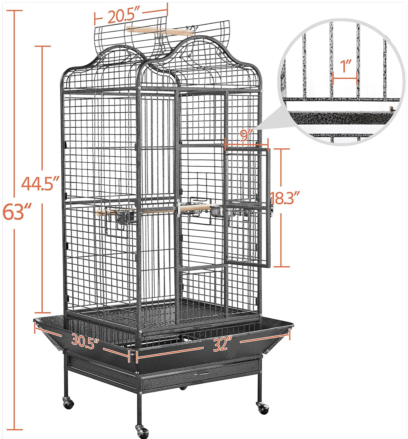
Image: Dimensional diagram of the bird cage, highlighting its overall size and bar spacing.