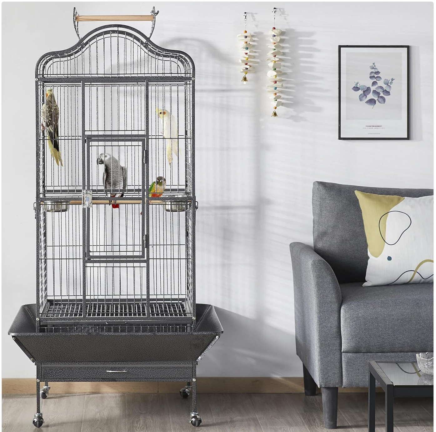
Image: Detailed view of the bird cage components and features, including the pull-out tray and seed guard.