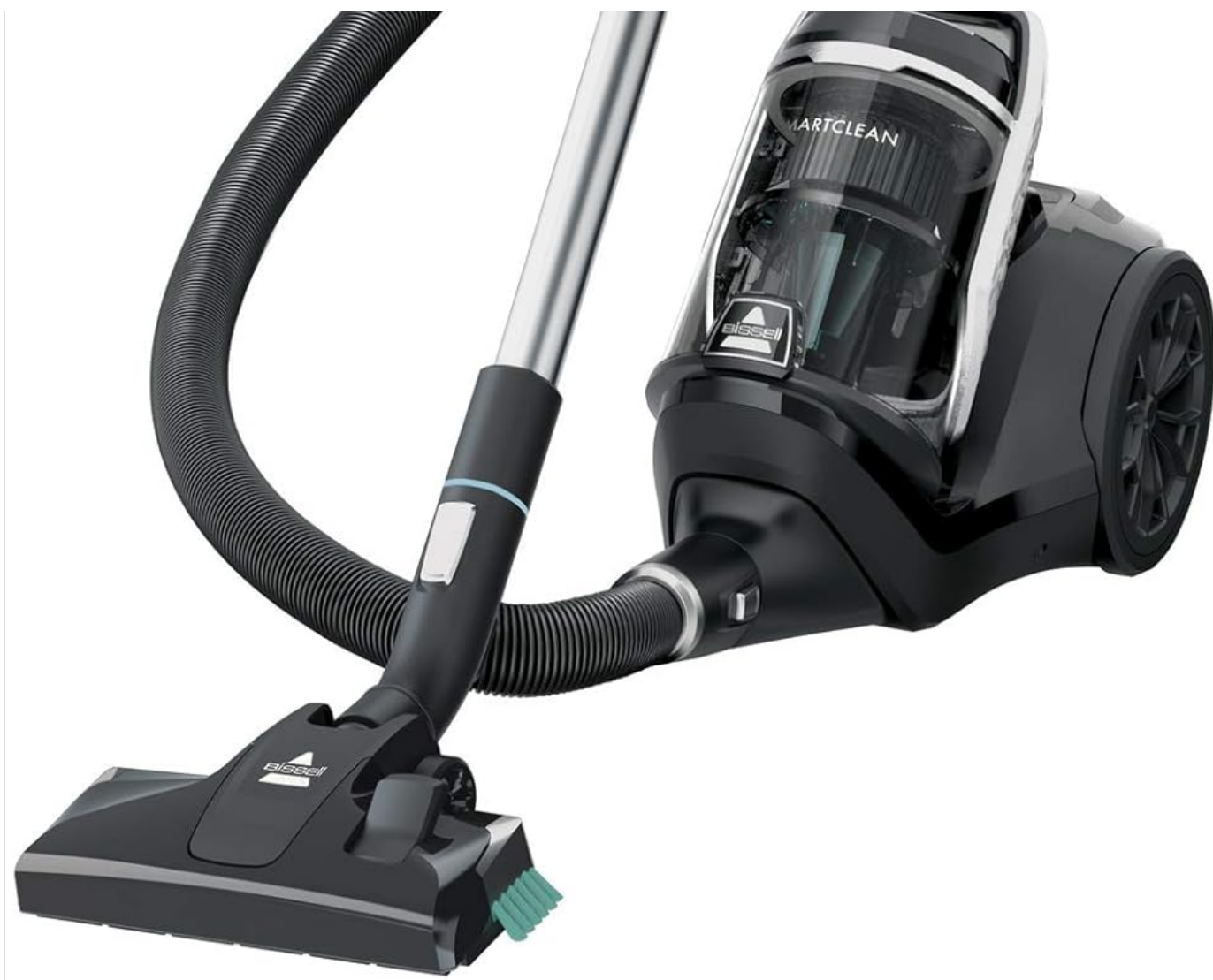
Figure 1: Overview of the Bissell SmartClean 2274N vacuum cleaner.