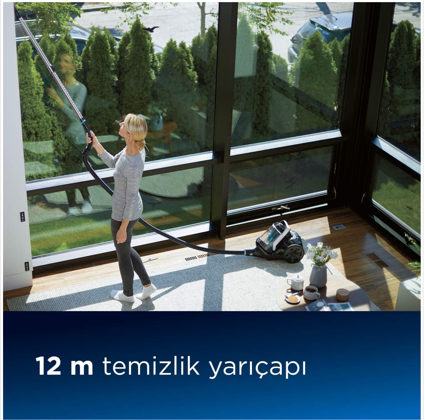
Figure 5: The vacuum's 12-meter operating radius facilitates cleaning large areas.