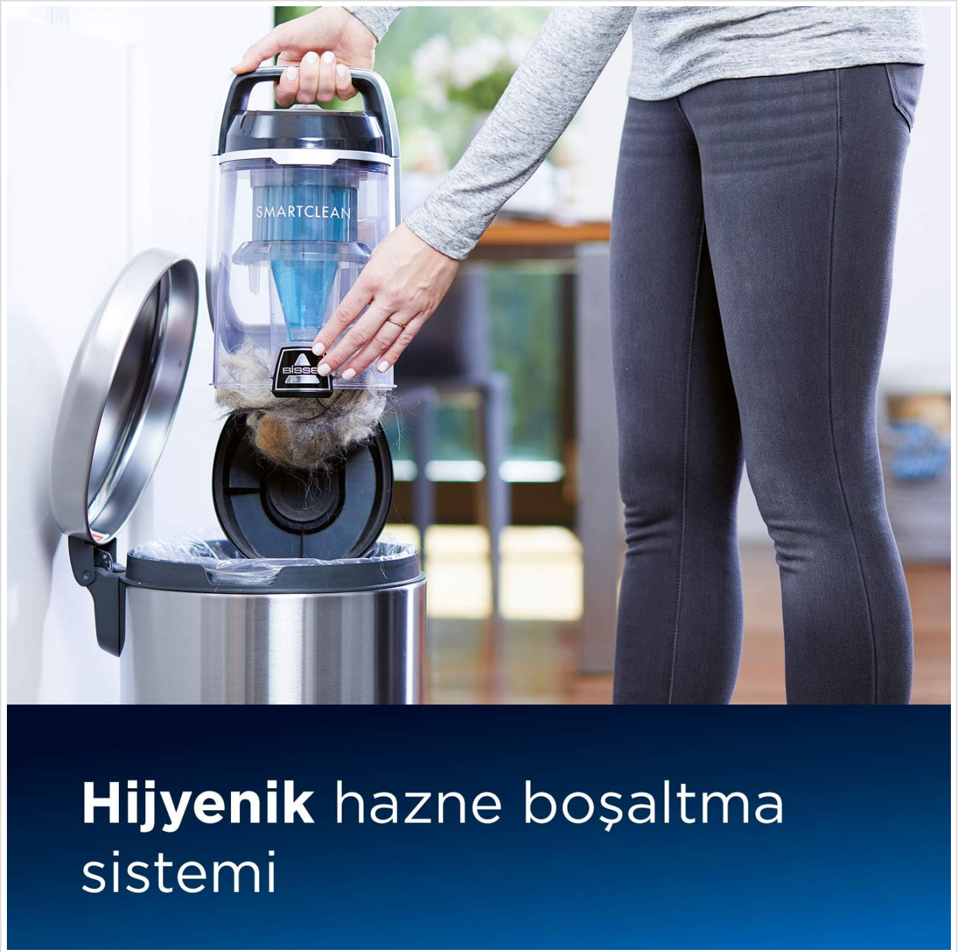
Figure 6: Hygienic emptying of the dustbin into a trash can.