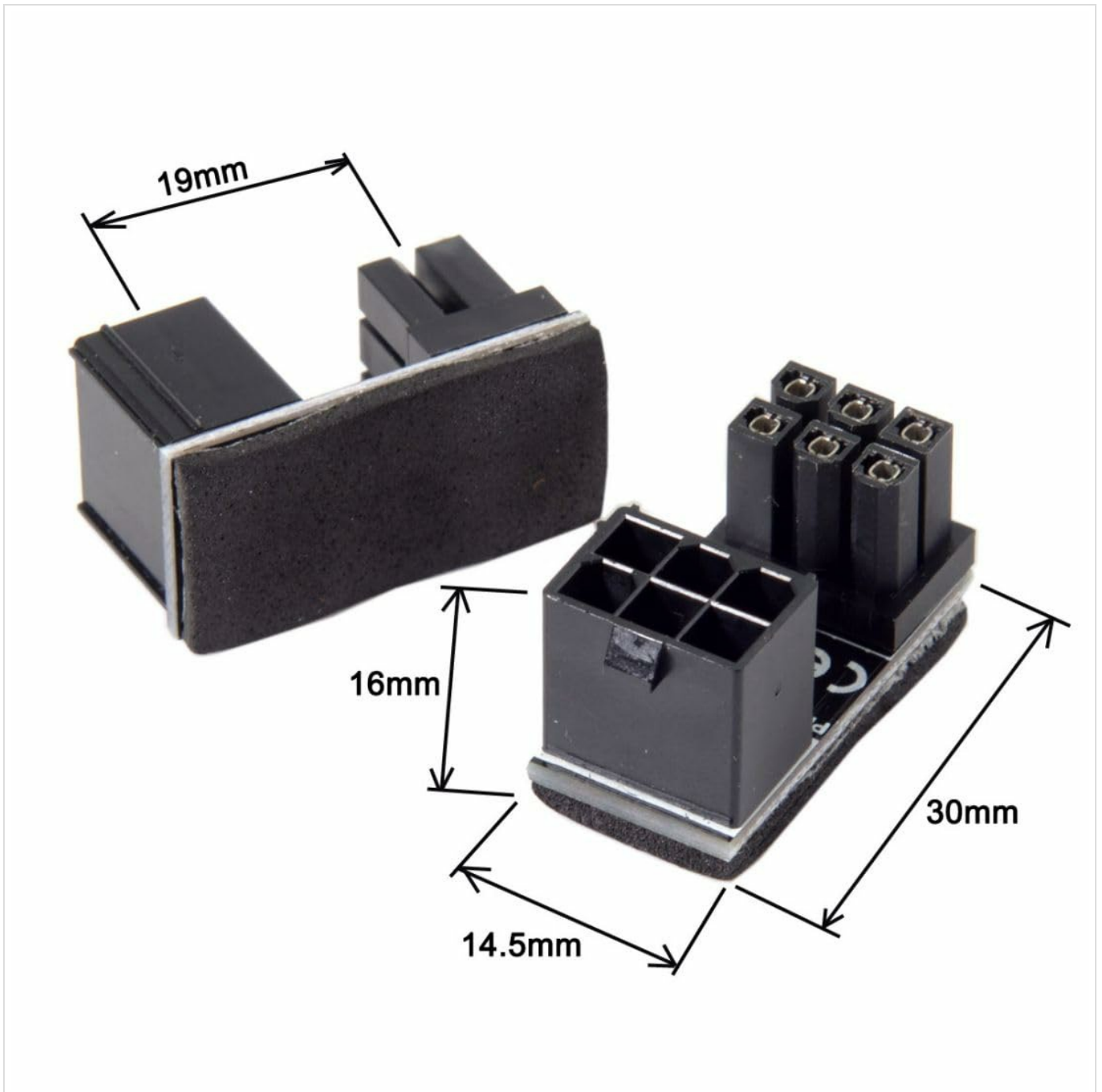
Image: Detailed dimensions of the 6-pin angled adapter, showing its compact size.