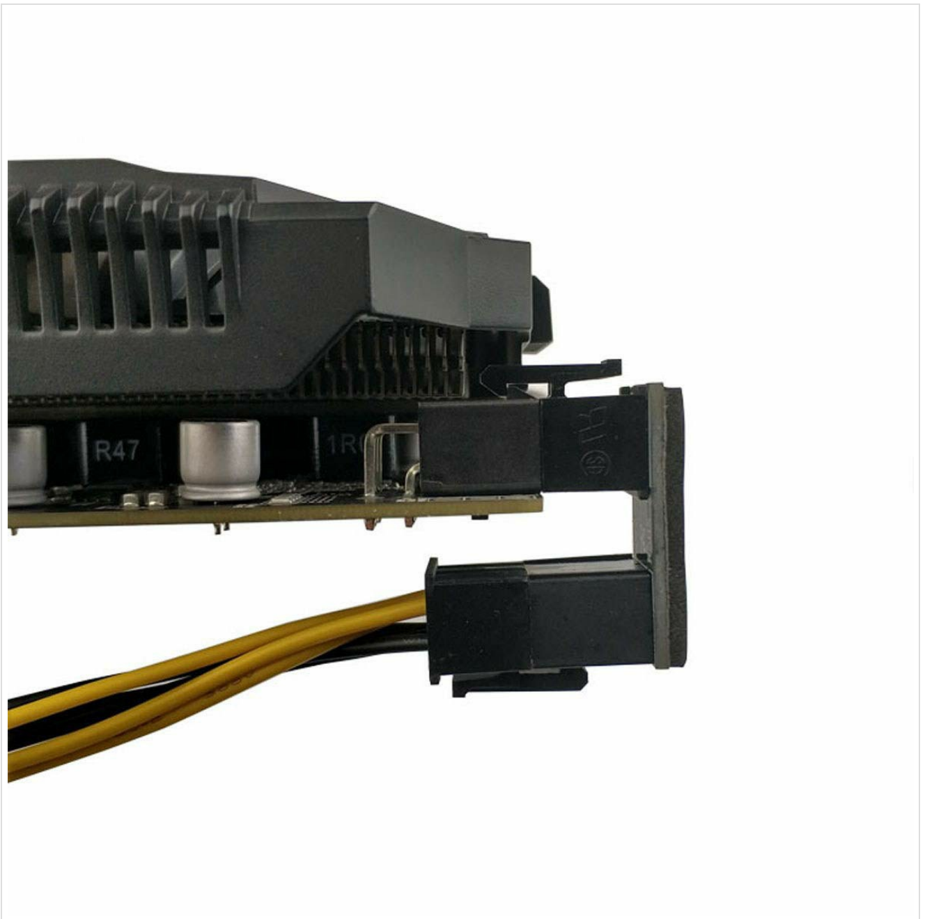
Image: Side view demonstrating the adapter's effect on cable routing, allowing the power cable to run horizontally along the GPU.