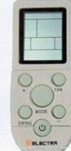
CODE 13 YKR-F/016E