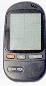
CODE 06 RC-4 HL