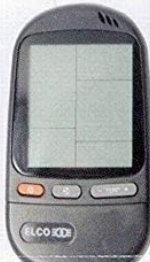
CODE 09 RC-41 RC