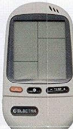
CODE 08 RC-4 RCL