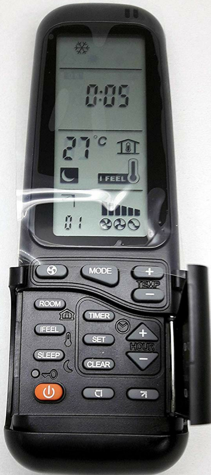
This image shows the front of the Calvas RC3 remote control, highlighting its digital display with temperature, mode, and timer indicators, along with the 'ifeel' function. The main control buttons for power, mode, and temperature adjustment are visible below the display.