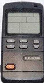
CODE 10 RC