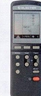
CODE 19 P/N 435600