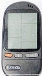
CODE 07 RC-41-1