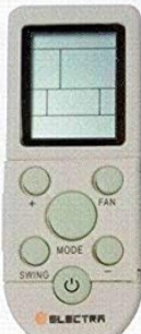
CODE 14 YKR-F/015E