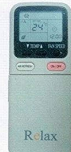
CODE 15 KK9A-C25